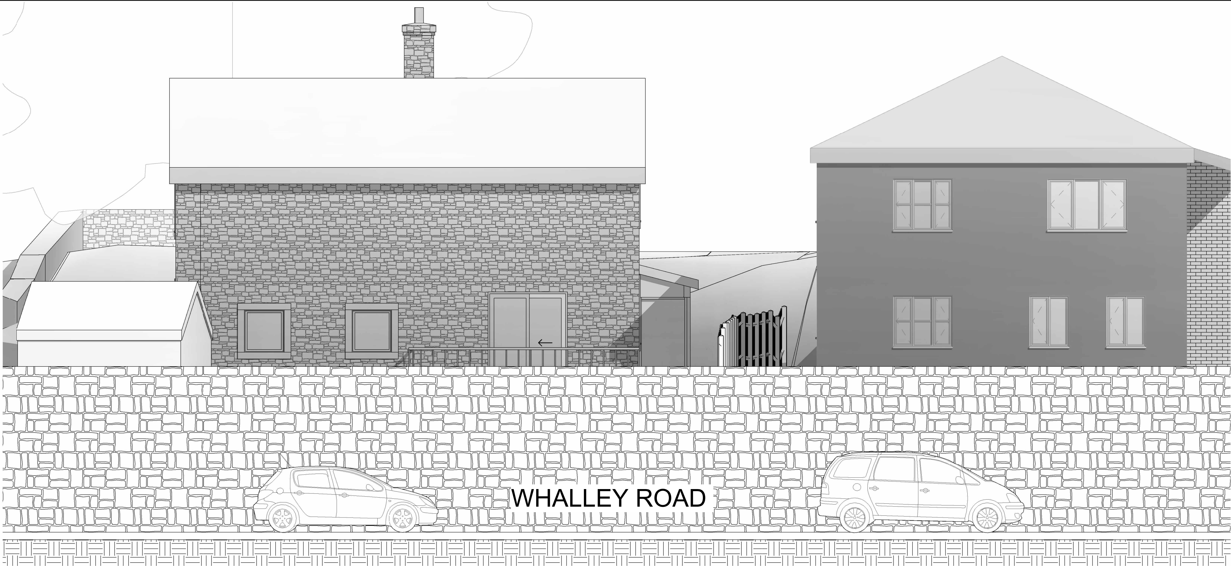
2 PROPOSED STREET VIEW WHALLEY ROAD Copy 1 1 : 50