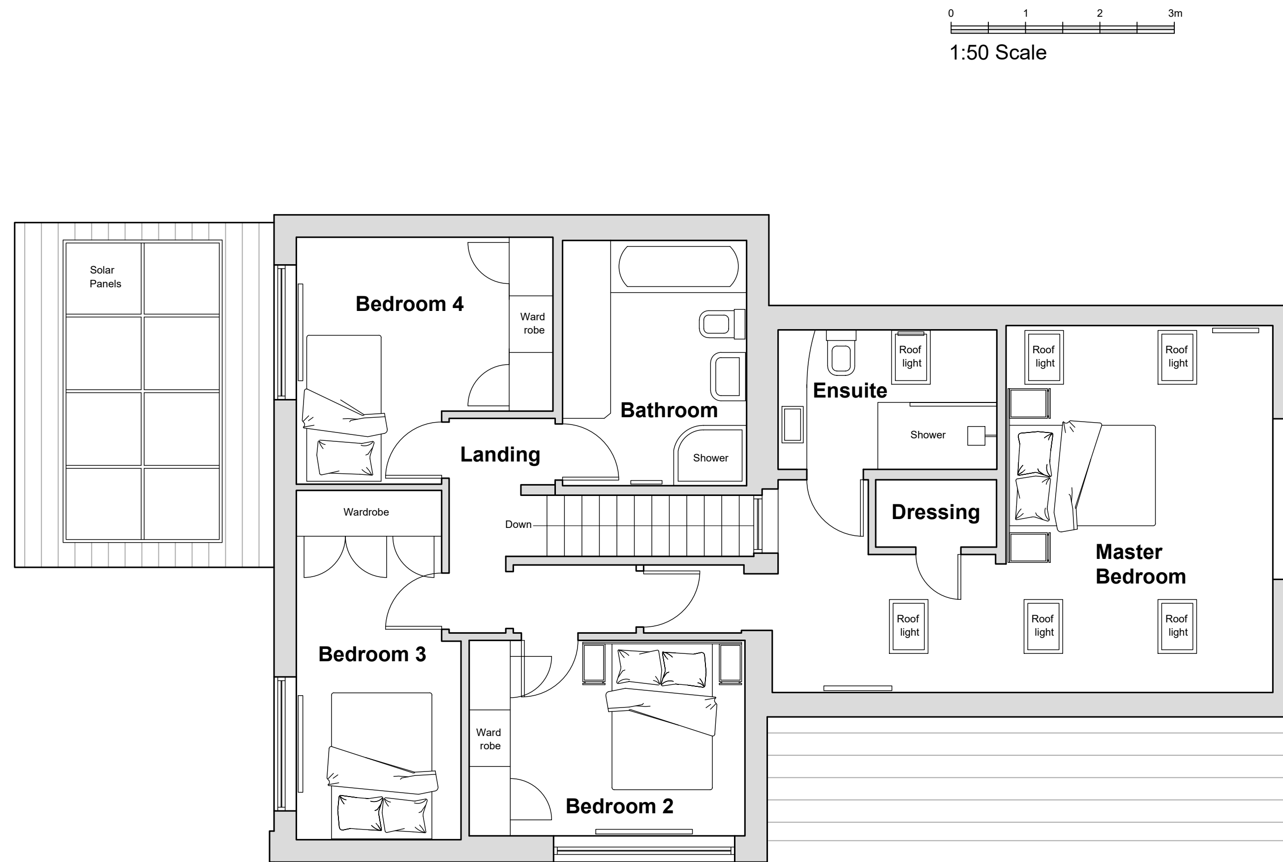
First Floor Plan 1:50 Scale