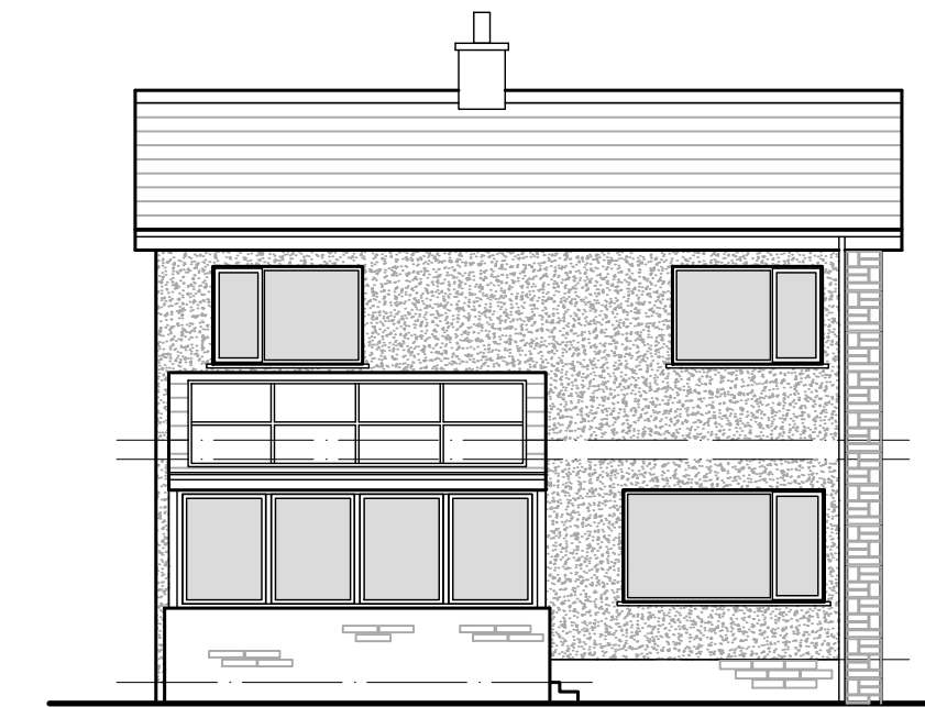
South Elevation 1:100 Scale