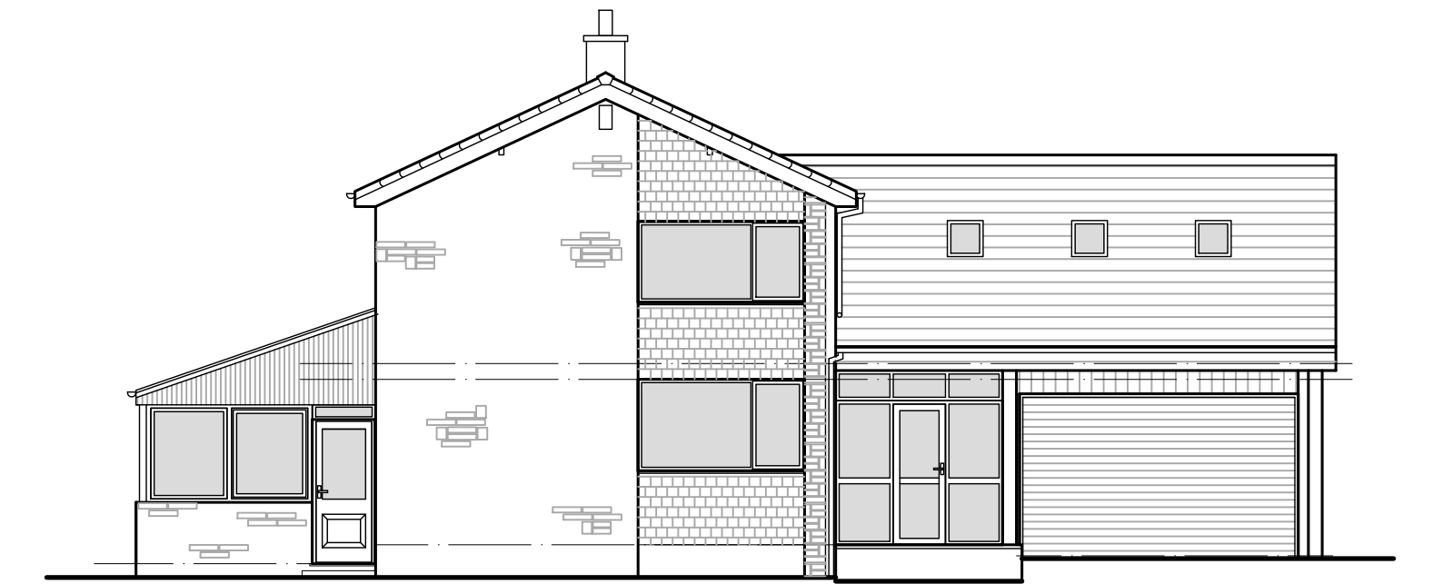
East Elevation 1:100 Scale