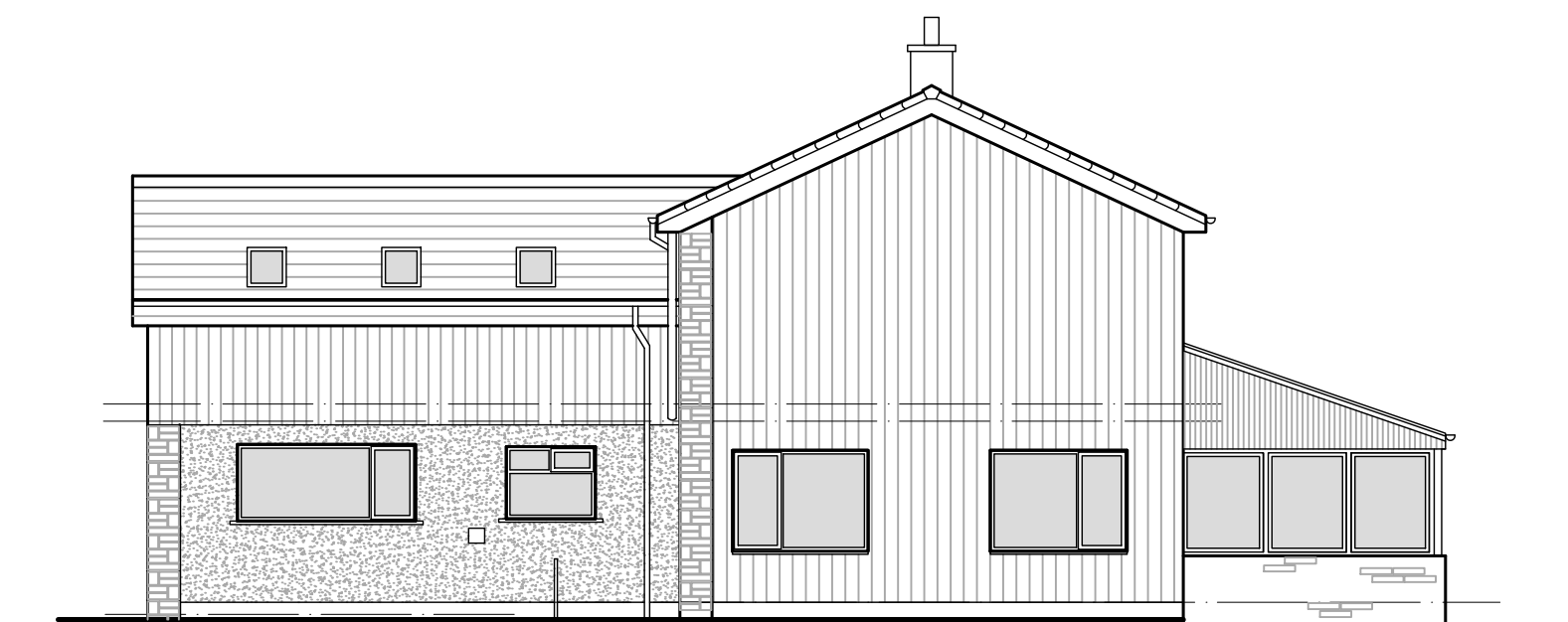
West Elevation 1:100 Scale