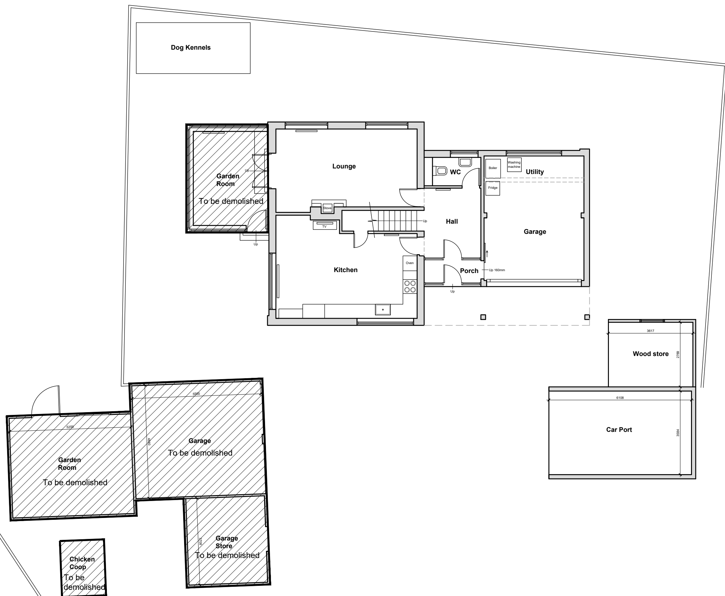
Site Plan 1:100 Scale