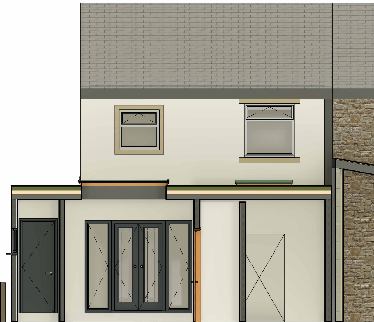
3 PROPOSED REAR ELEVATION 1 : 50

The rear of the property will also be re-finished in a render finish. The proposed rear extension will be finsihed in render aswell. The rear extension will open into the existing kitchen and will house a garden store , larger overall kitchen and a small utility bathroom. These spaces will be illuminated by two lantern lights , one window and a set of double doors. The extension will be covered by a sedum green roof design.