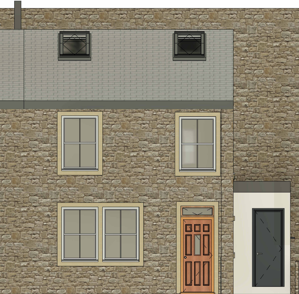
1 PROPOSED FRONT ELEVATION 1 : 50

Rooflights to attic space have been previously installed and no changes to the principal elevation. The rear extension may be visable to the side of the entrance but due to the topography of the site and its location , this will be barely visable from within the public domain.