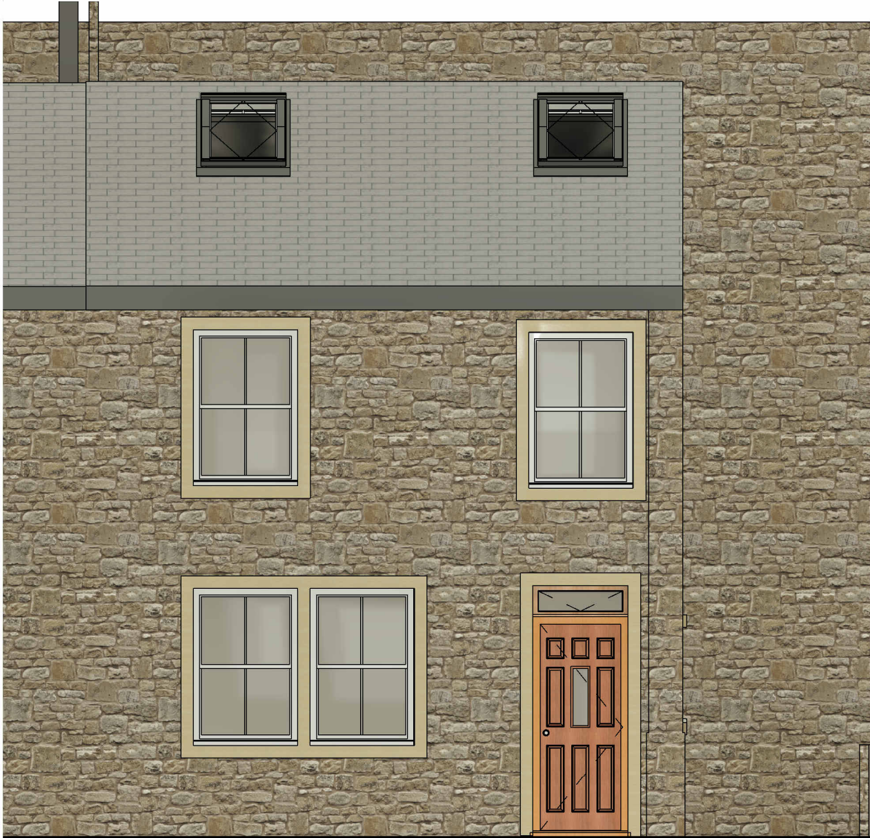
4 EXISTING FRONT ELEVATION 1 : 50