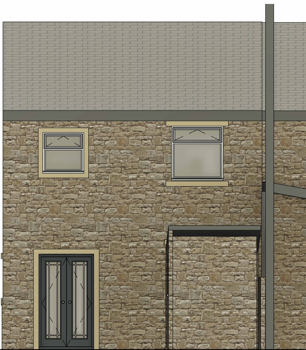
6 EXISTING REAR ELEVATION 1 : 50