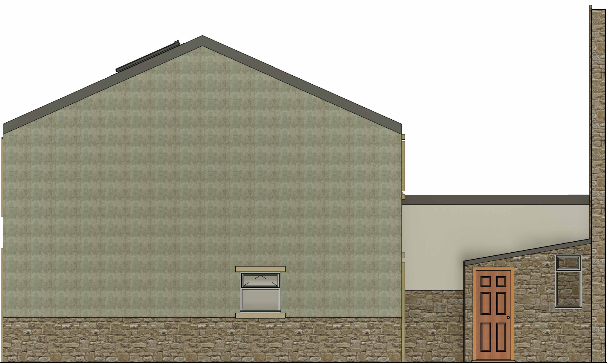
5 EXISTING SIDE ELEVATION 1 : 50