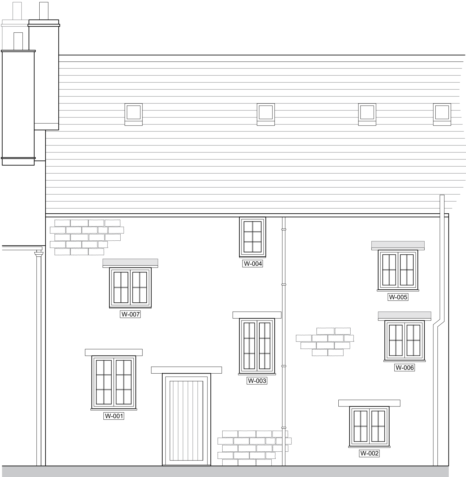
Proposed Elevation Scale 1:50