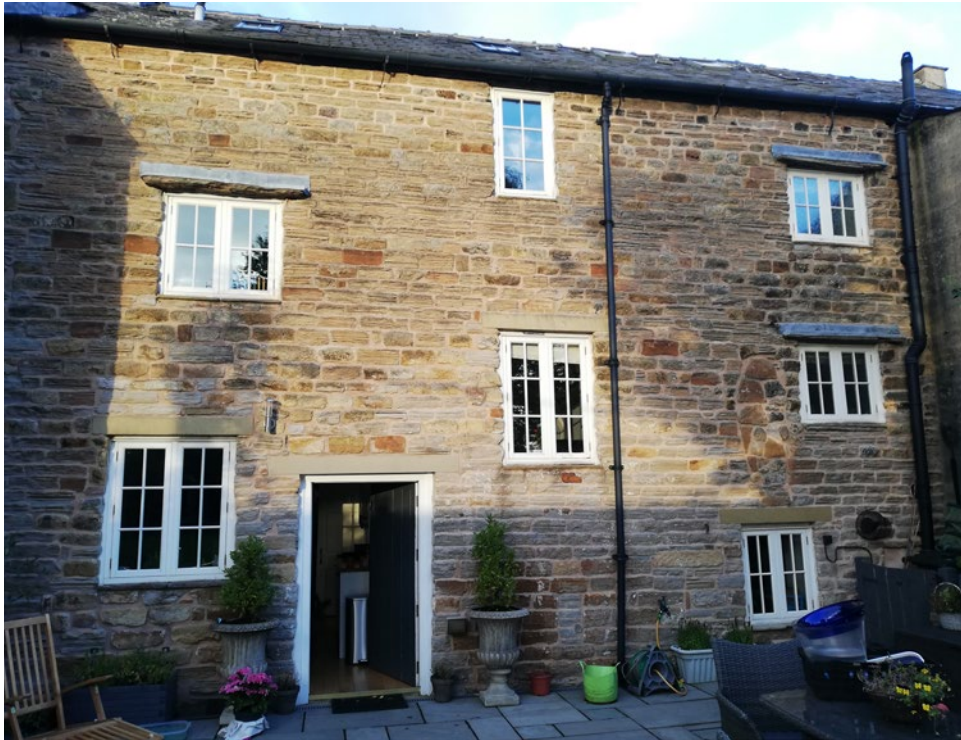
Fig 2. External photograph viewed from the rear yard.