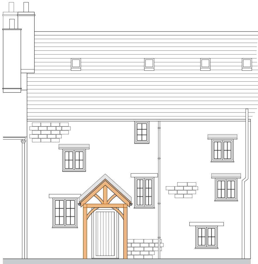
Fig 4. Proposed Rear Elevation

3.2 For more information see drawing ref: 6900-P01-Proposed Porch Plans and Elevations.