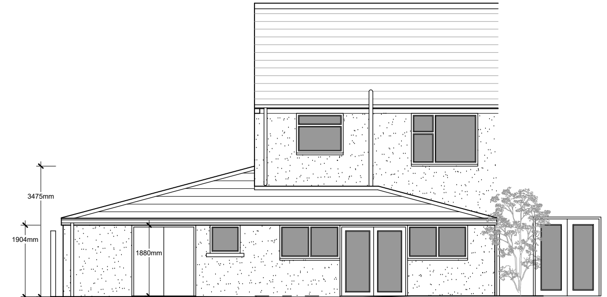
Rear North East Elevation