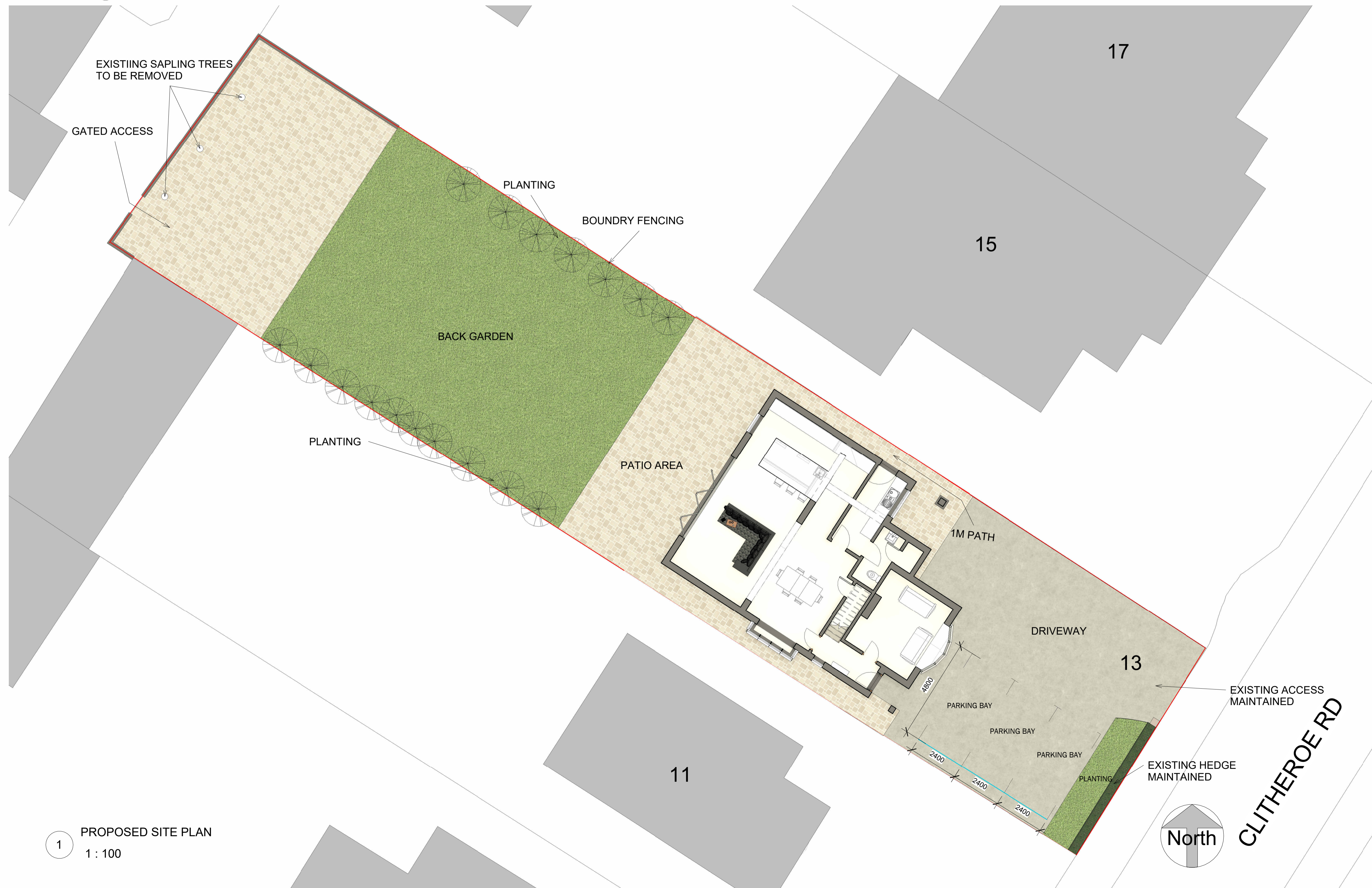
1 PROPOSED SITE PLAN 1 : 100