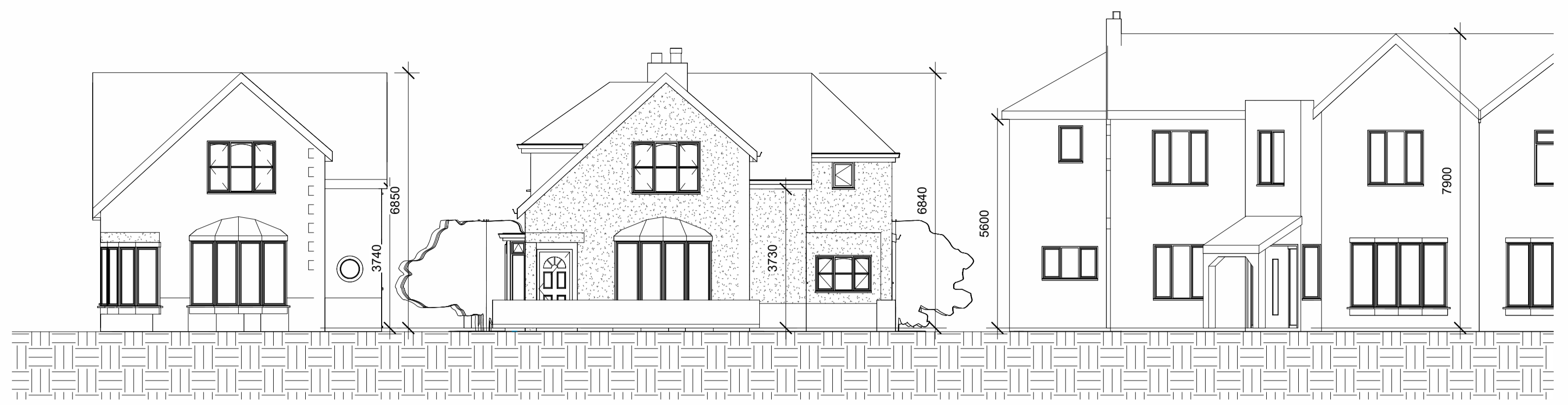
2 STREET VIEW 1 : 100