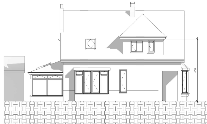
1 0 GROUND FLOOR 1 : 25