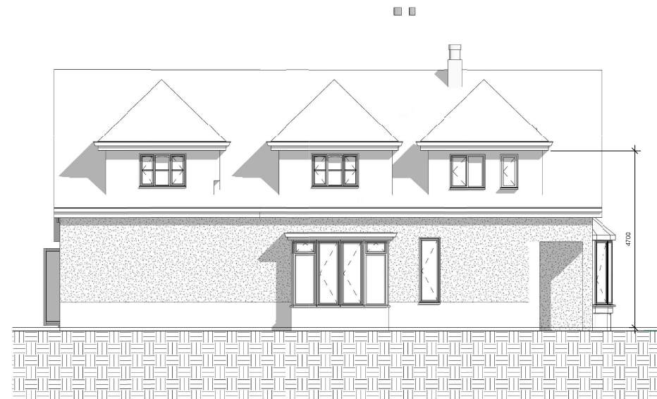
2 PROPOSED SOUTH 1 : 50