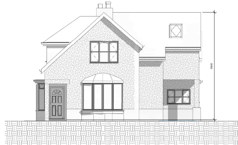
3 PROPOSED EAST 1 : 50