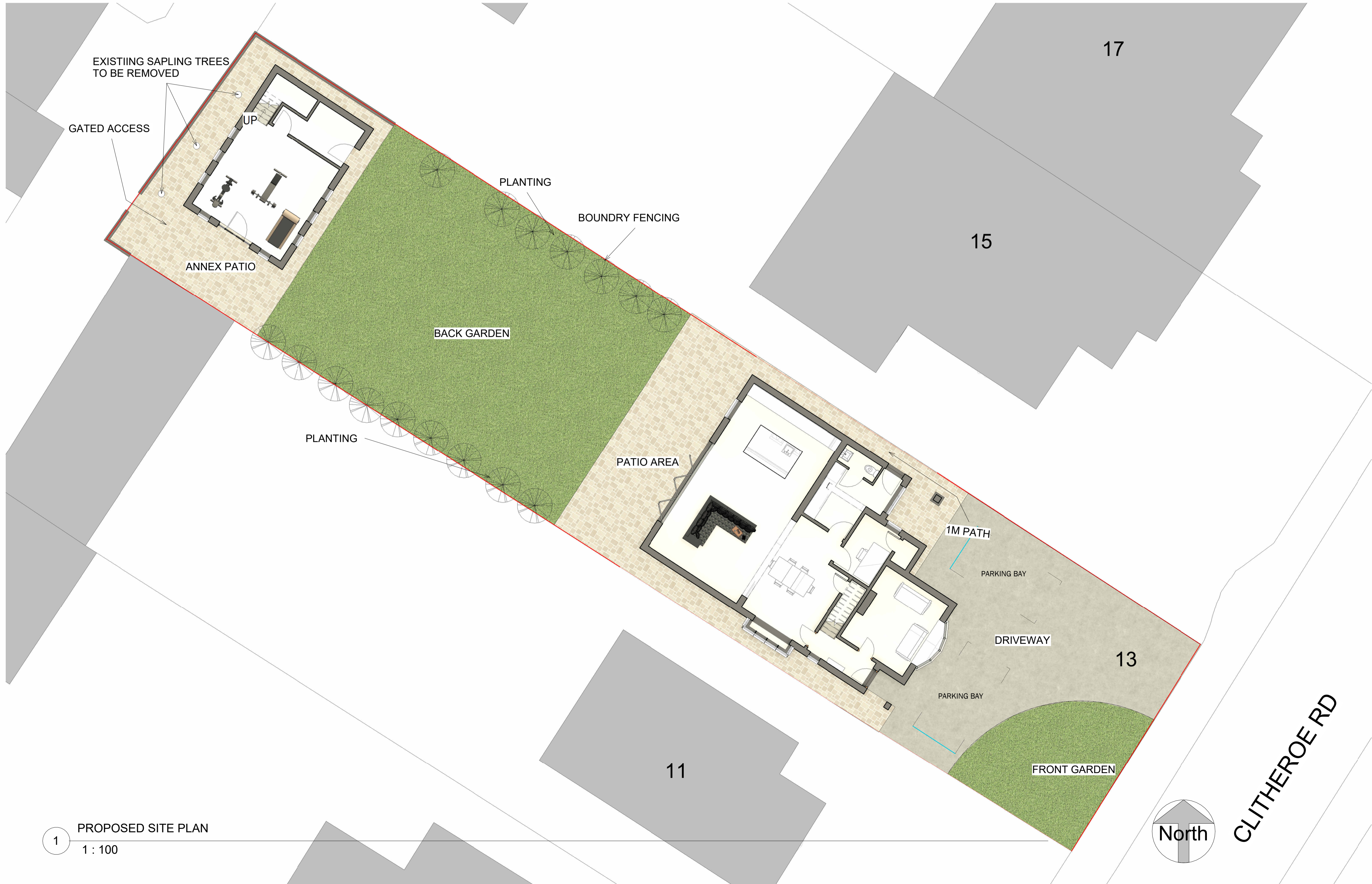
1 PROPOSED SITE PLAN 1 : 100