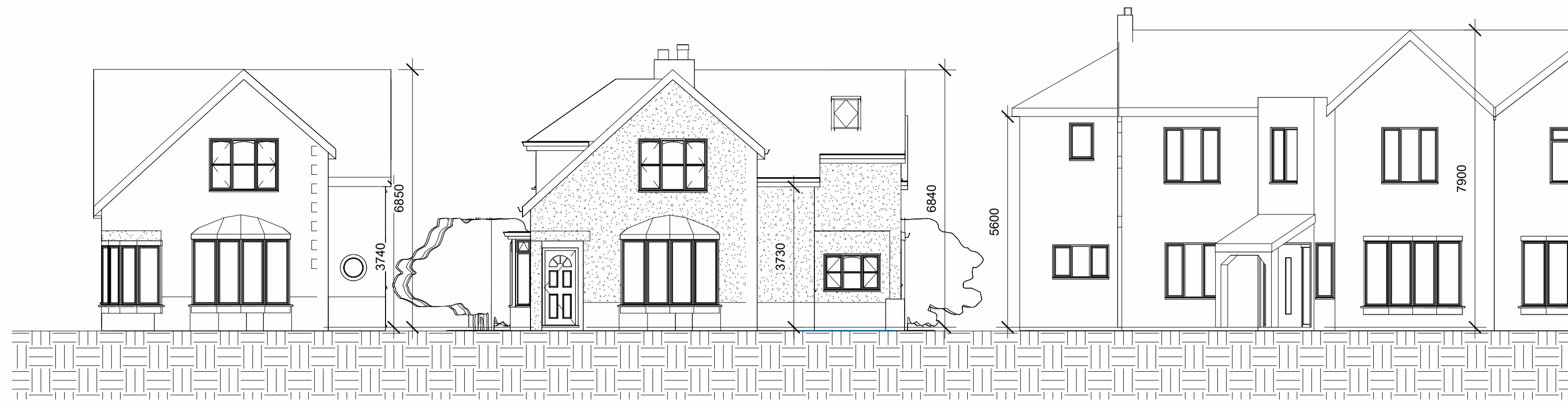
2 STREET VIEW 1 : 100