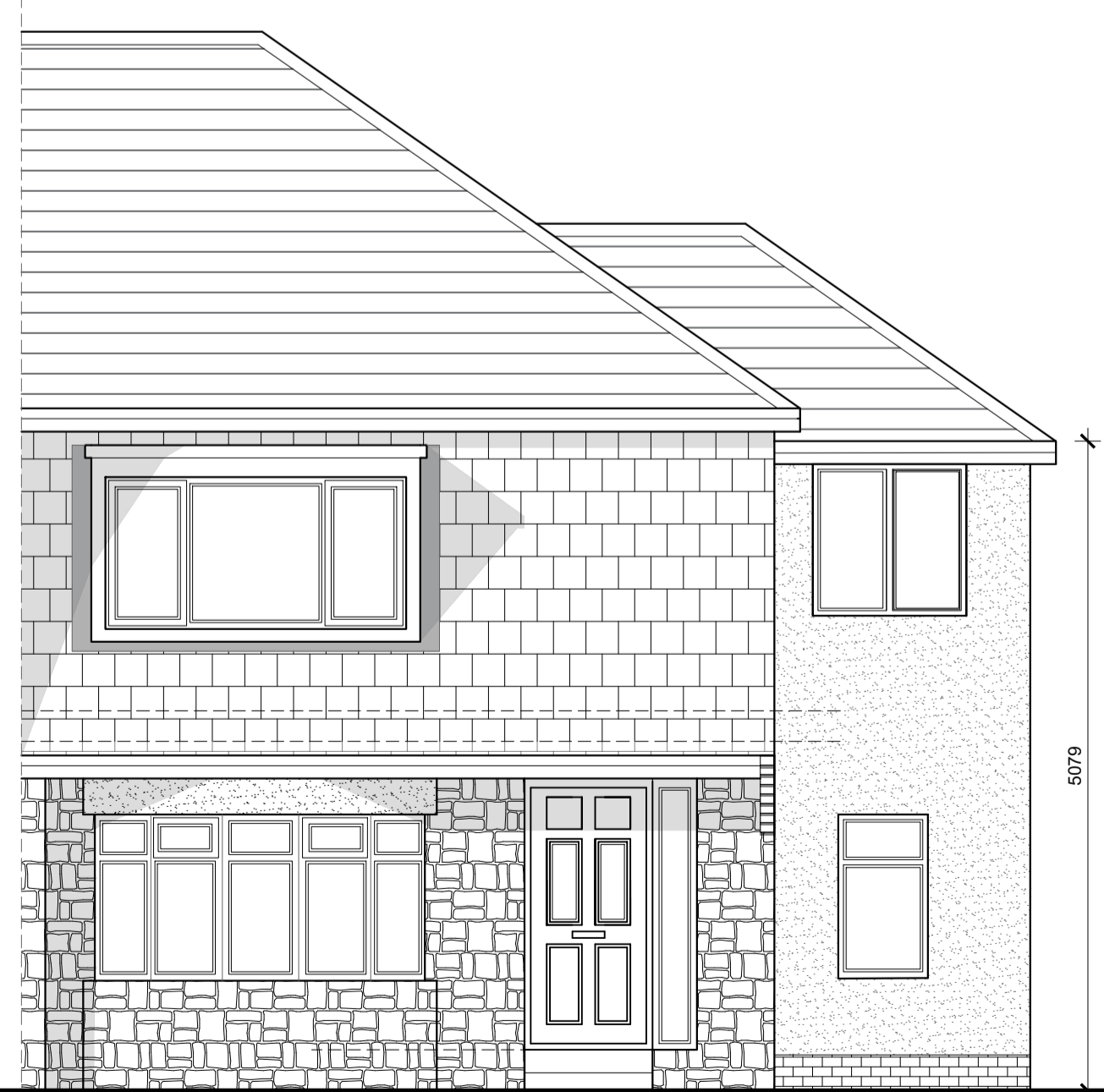
Proposed Front Elevation 1:50