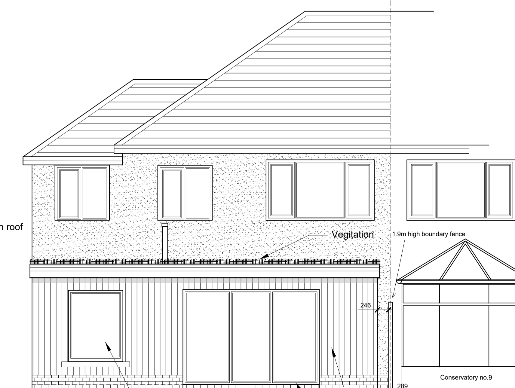
Proposed Rear Elevation 1:50