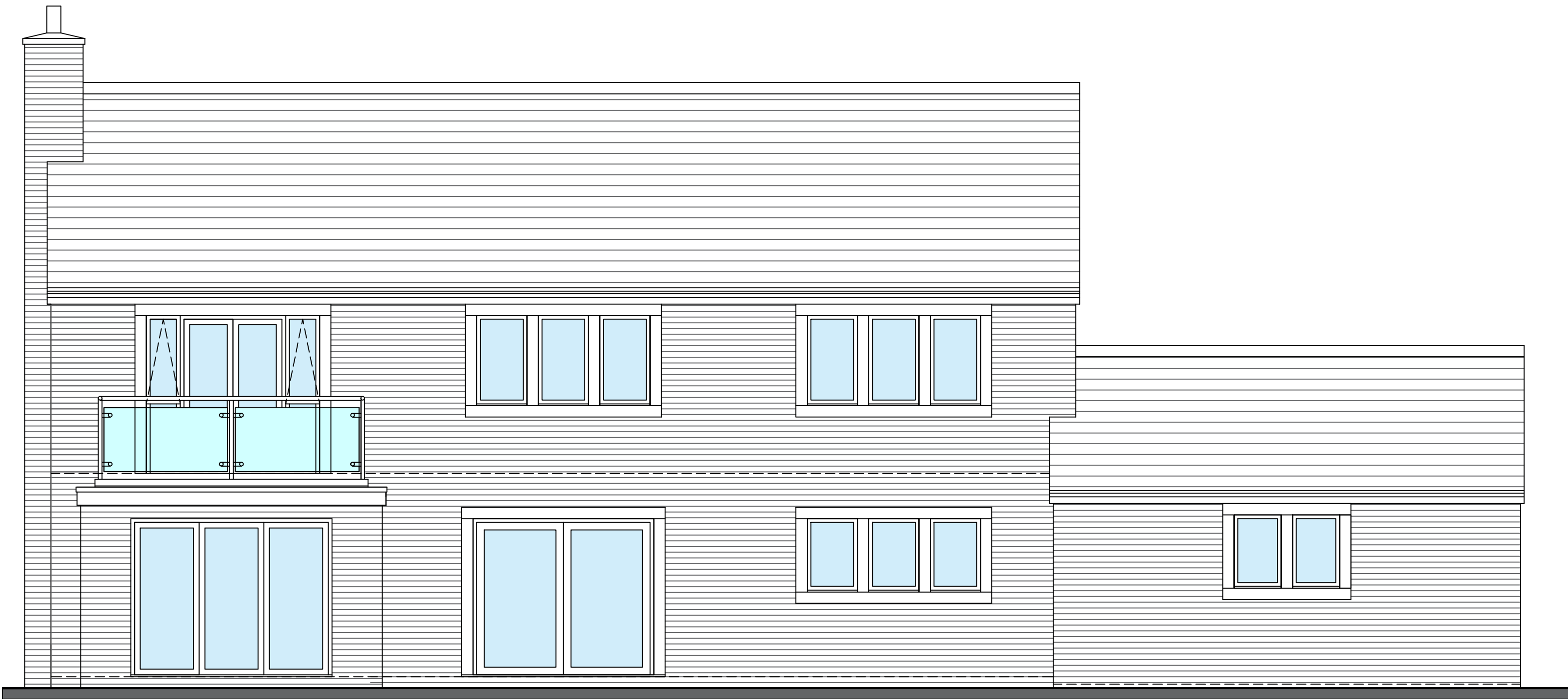
1:50 PROPOSED REAR ELEVATION