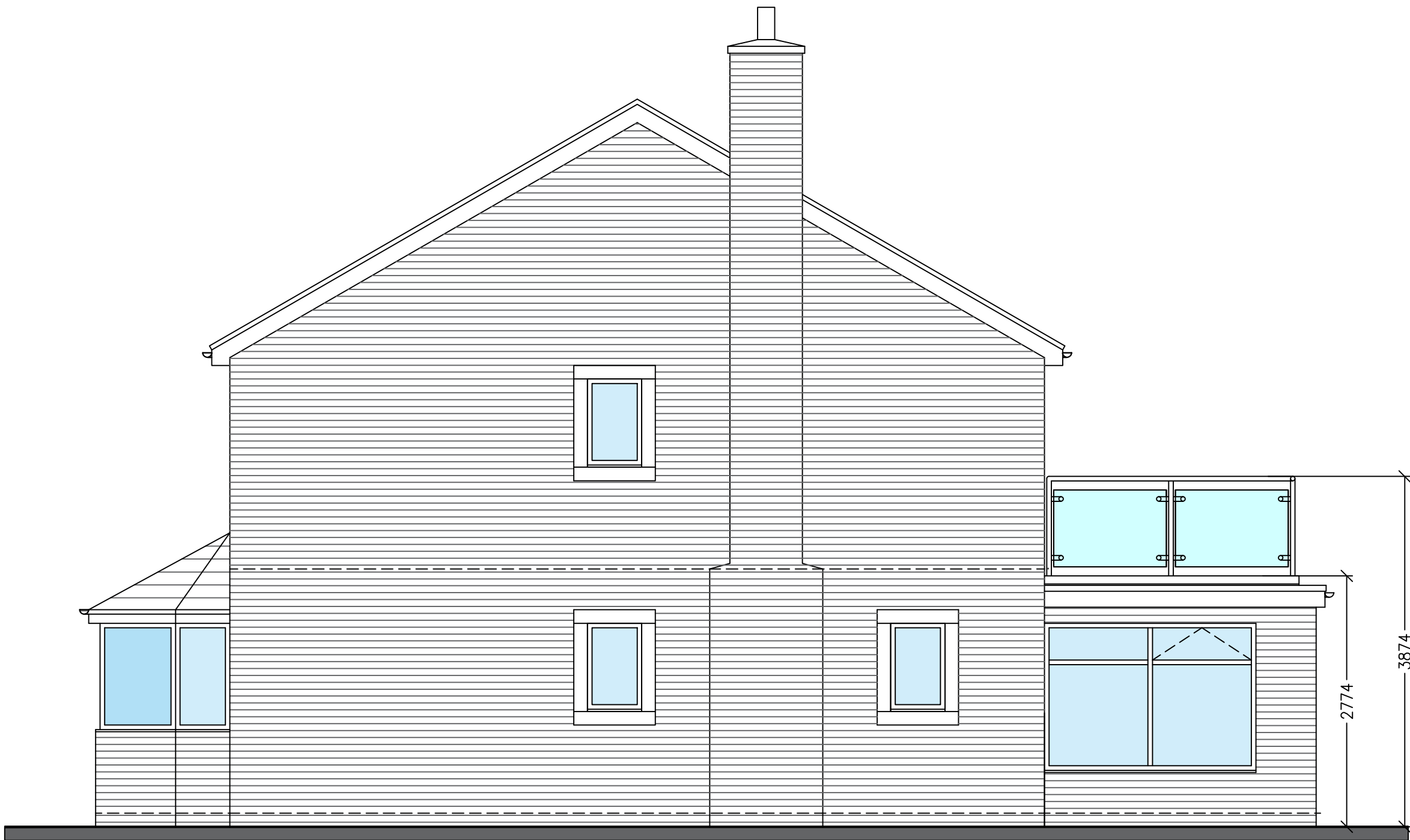
1:50 PROPOSED SIDE ELEVATION