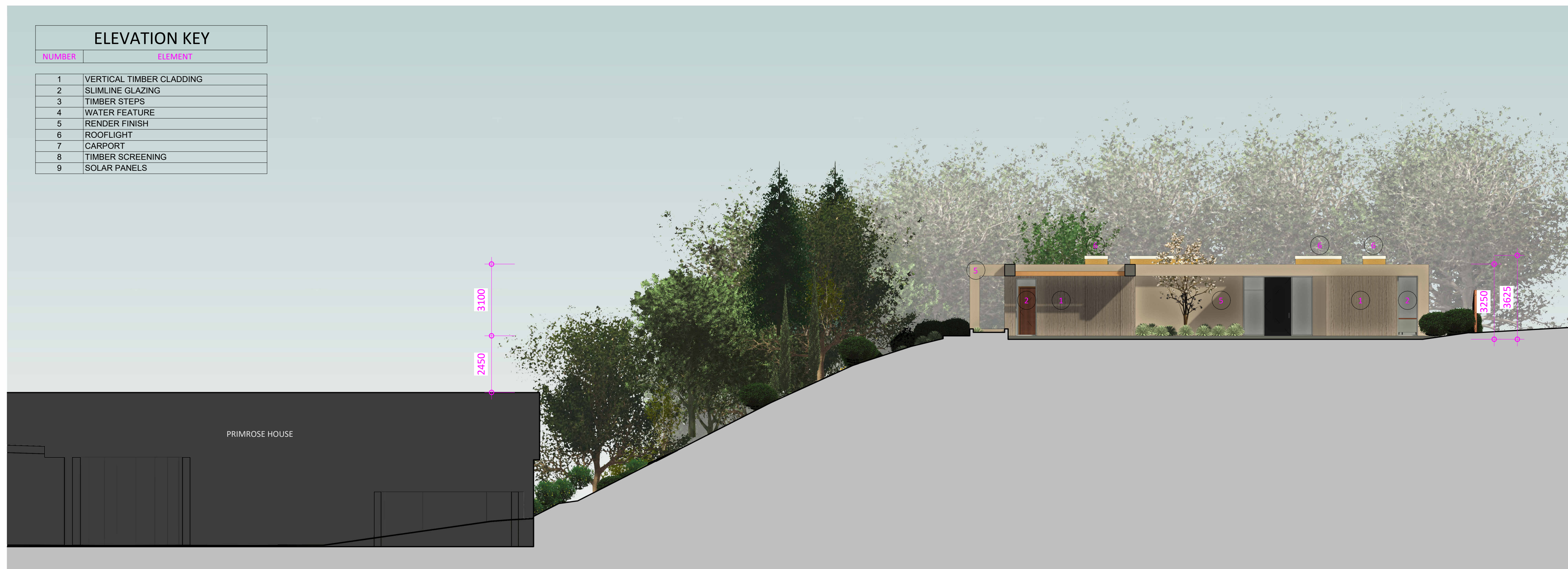
1 PROPOSED NORTH EAST ELEVATION 1 : 100