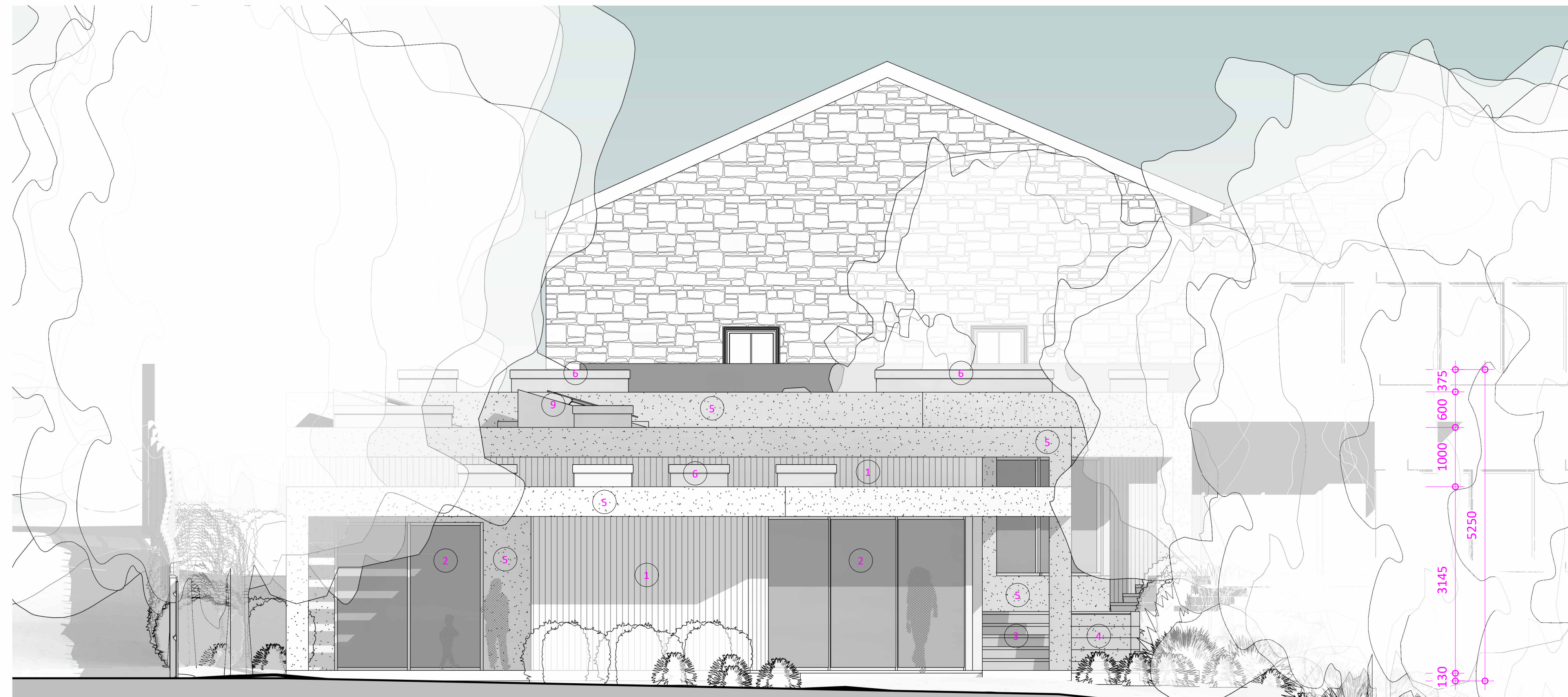
2 PROPOSED SOUTH WEST ELEVATION - TECH 1 : 50

PROJECT: SP/160 NOVA, PRIMROSE ROAD, CLITHEROE, BB7 1BS CLIENT: MR & MRS STEPHENSON