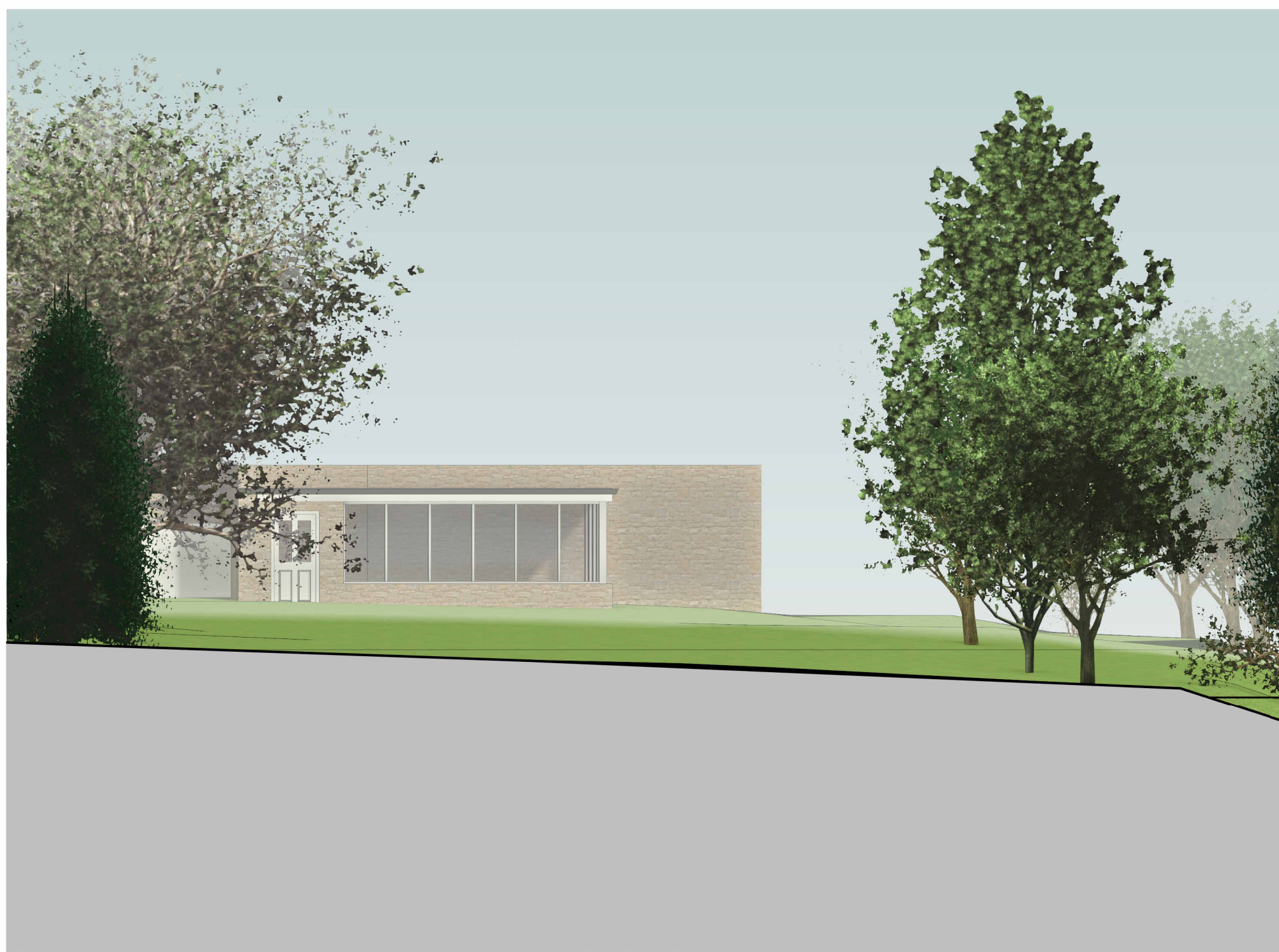
2 EXISTING SITE SECTION 2 1 : 100