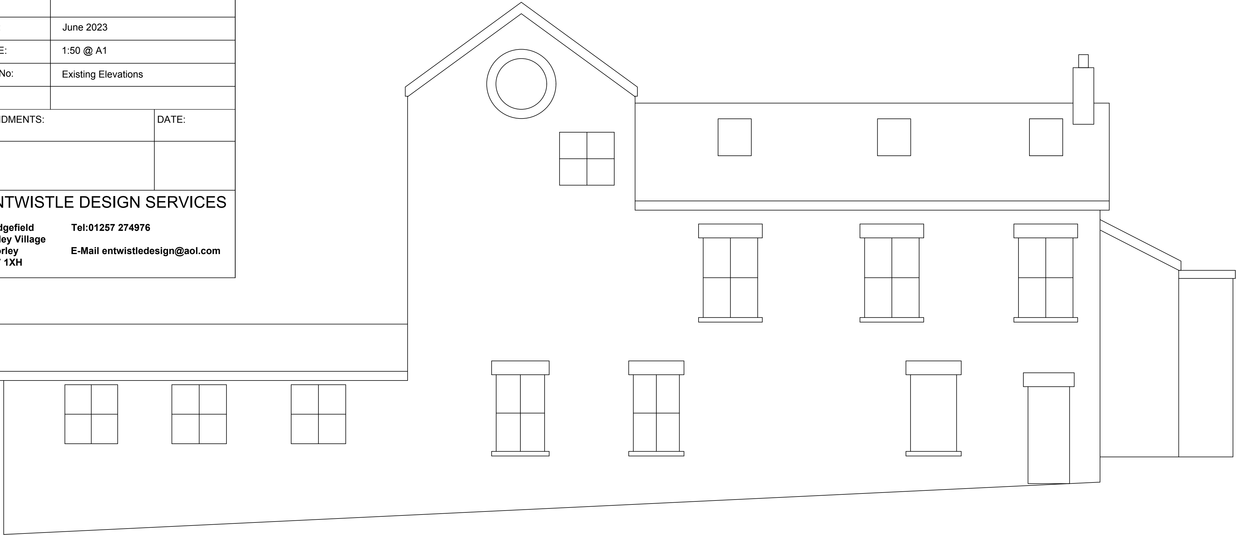
0m 1m 2m 3m 4m 5m Existing Rear Elevation