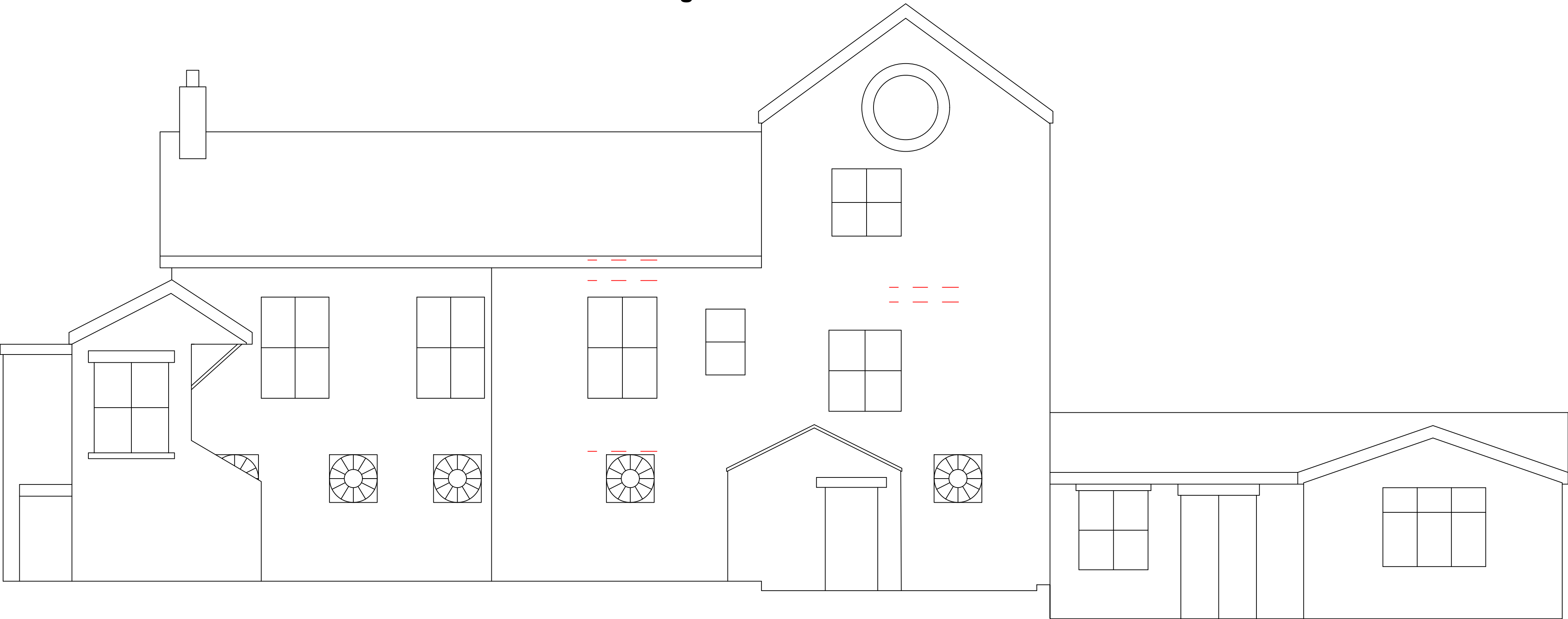
0m 1m 2m 3m 4m 5m Existing Front Elevation