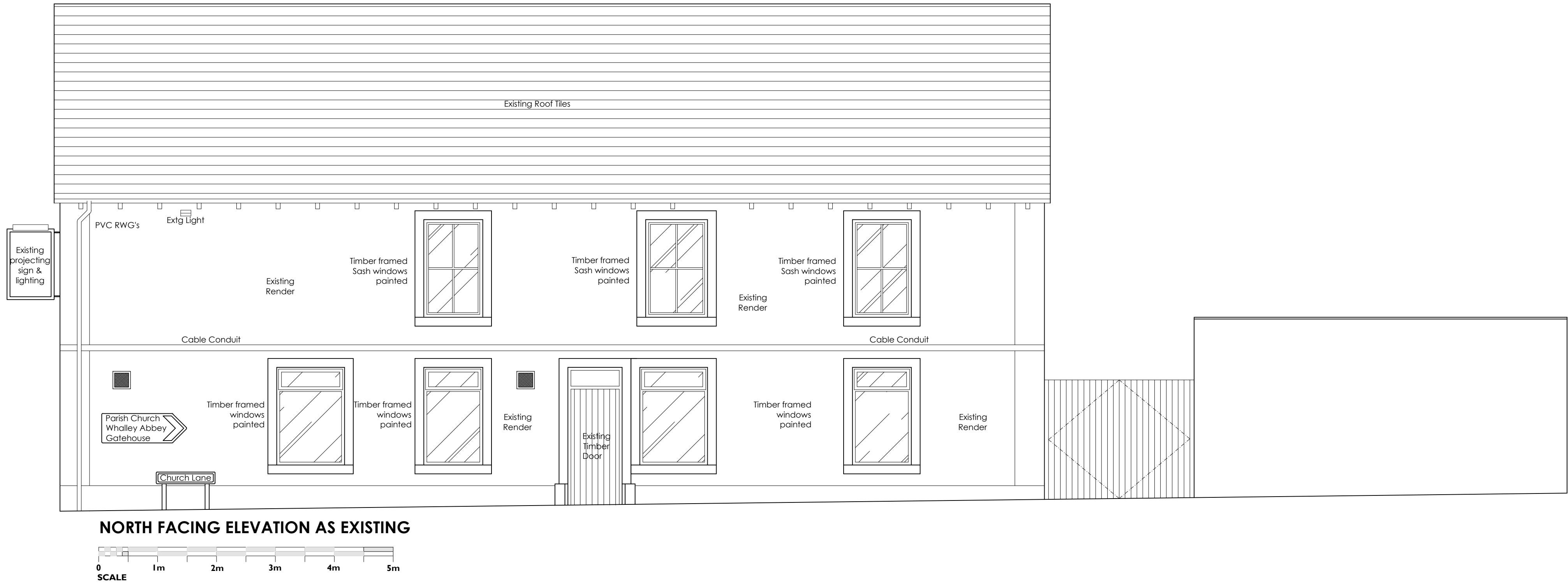
NORTH FACING ELEVATION AS EXISTING