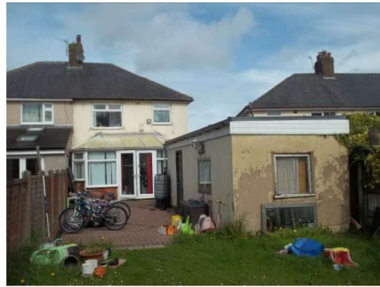
Front and rear elevations, plus garage

It is in a semi-rural location, with woodland along a railway track about 60m away: