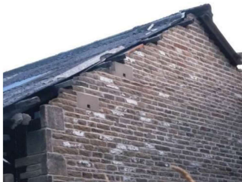
Example of Forticrete boxes in situ

A similar box is available from Habibat. See above listing.