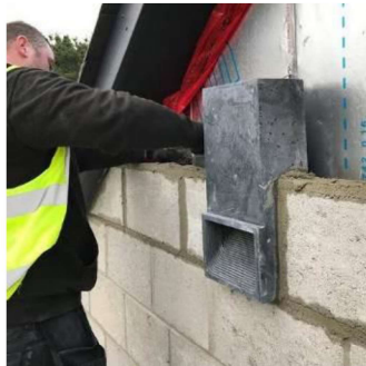
Green and Blue Bat Block/Brick in situ

https://www.greenandblue.co.uk/products/bat-block-bat-brick