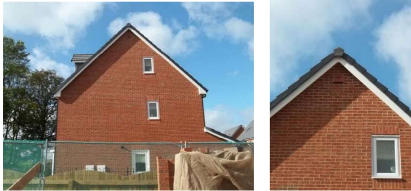
Above: typical unit in situ.