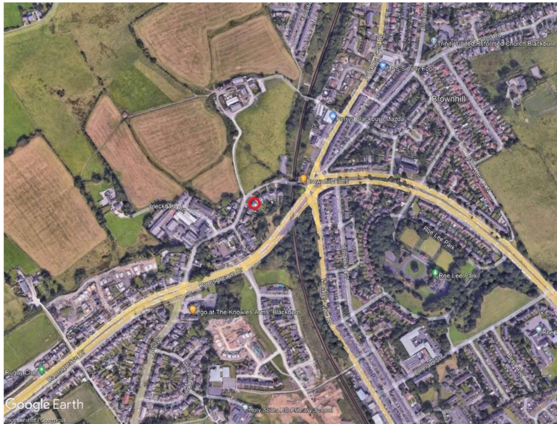
Location of property indicated by red circle

It is in a semi-rural location, with woodland along a railway track about 60m away: