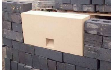
Above and below - standard colours available. Others available to order

Available from building-supply merchants