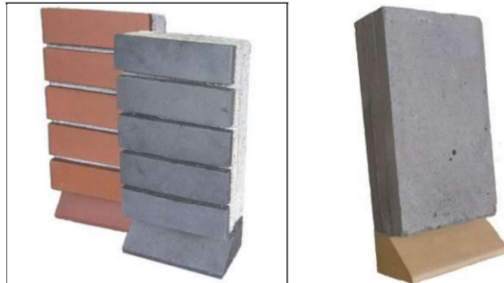
Example of Habibat boxes Can also be faced with stone.

"Designed to be built into an exterior wall and is available in a variety of faces to match the building. Standard facings of red or blue brick - ideal for new builds - are normally available from stock, or boxes can be made to your specific requirements with a face of brick, stone, timber, or plain (for rendering). Supplied un-pointed."