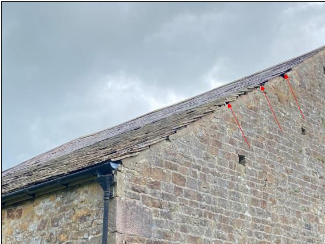
Plan 3: Roost entry provision along the verges of the south facing gable will be re-incorporated.