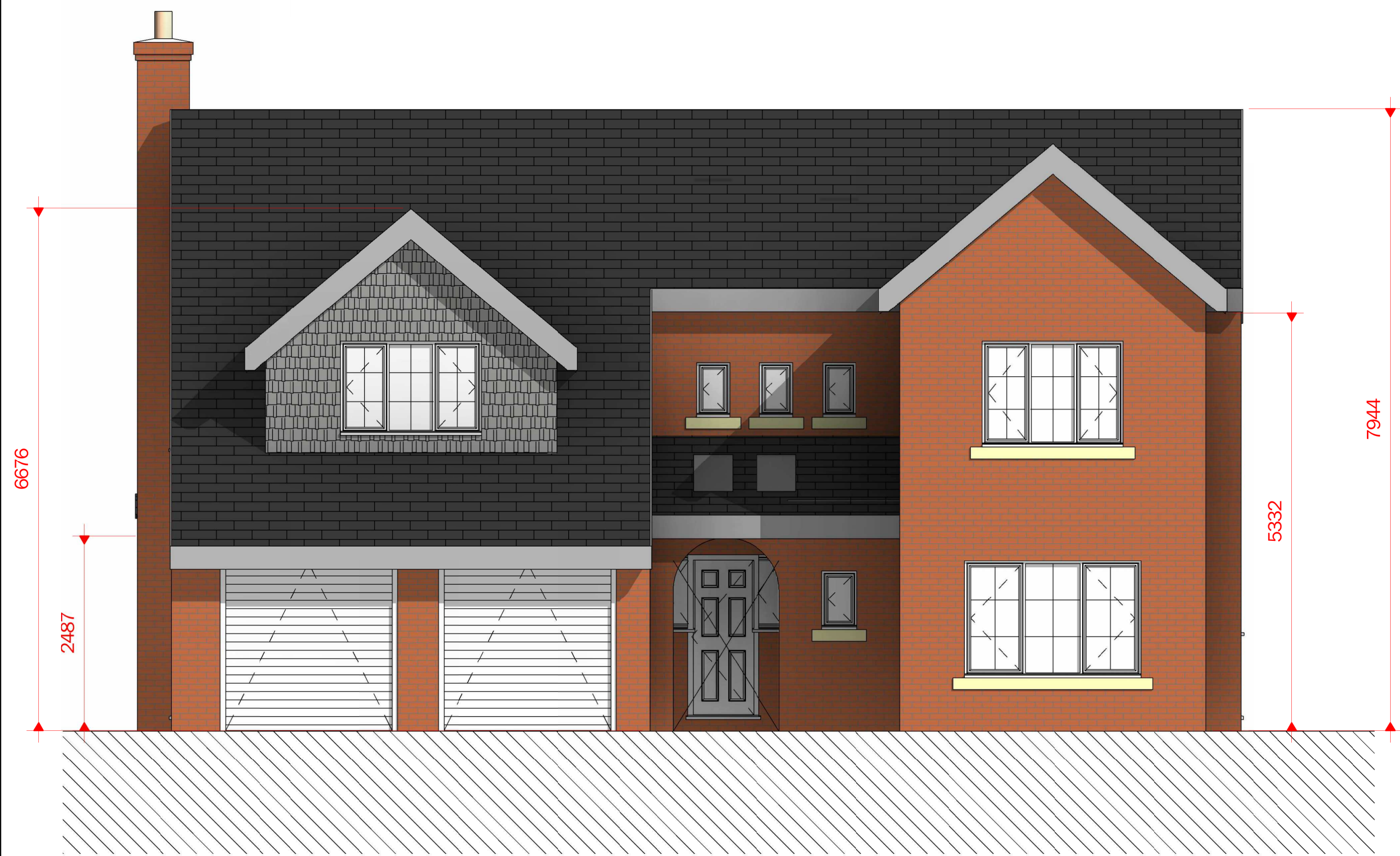
3 EXISTING EAST 1 : 50