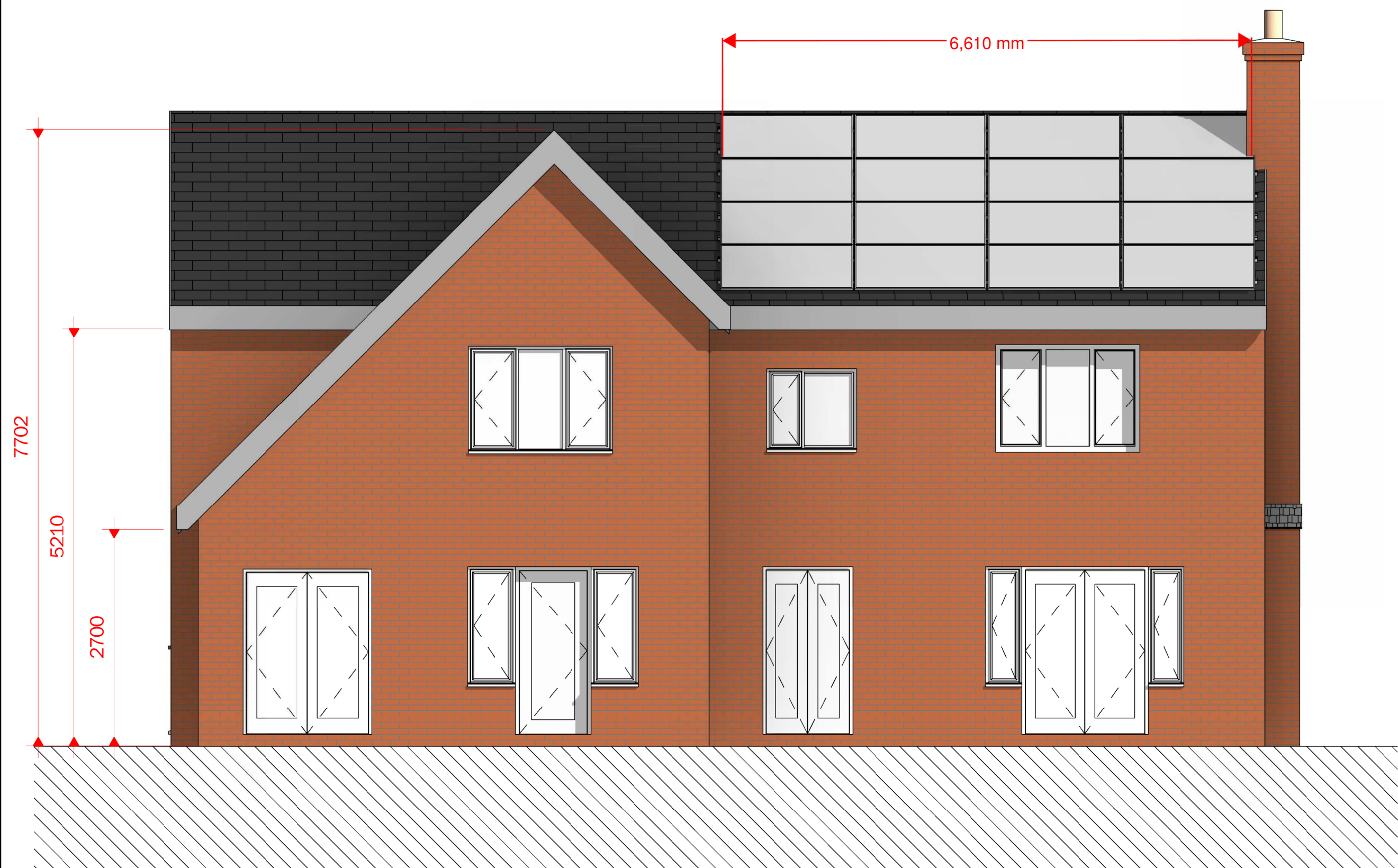
2 EXISTING WEST 1 : 50