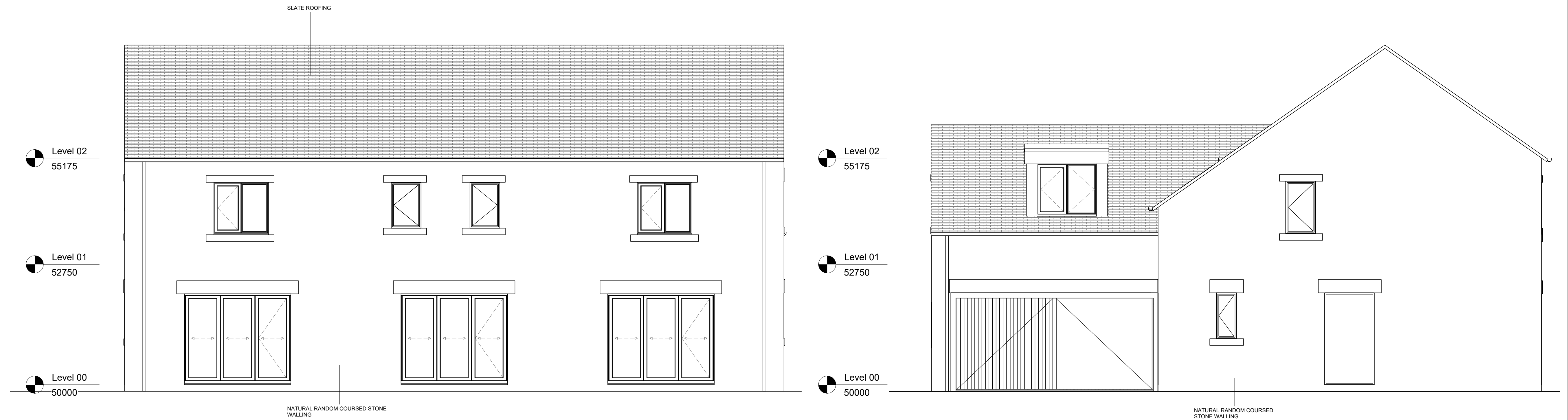
2 Existing - Rear Elevation 1 : 50