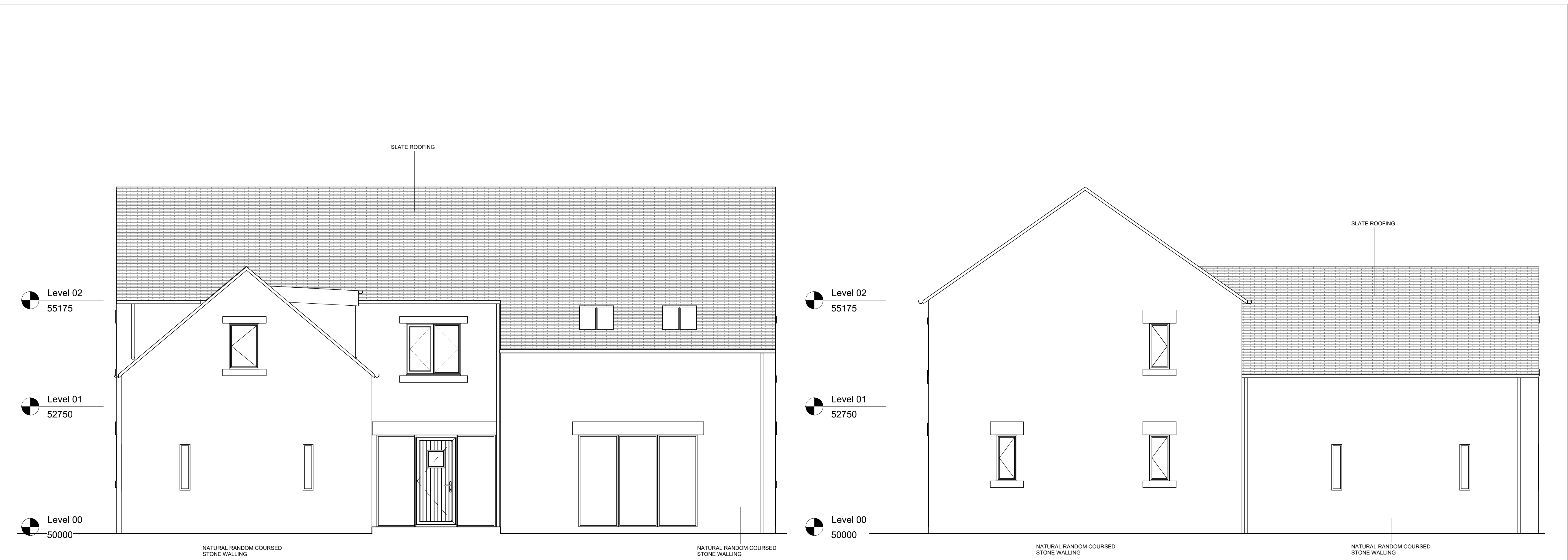
1 Existing - Front Elevation 1 : 50