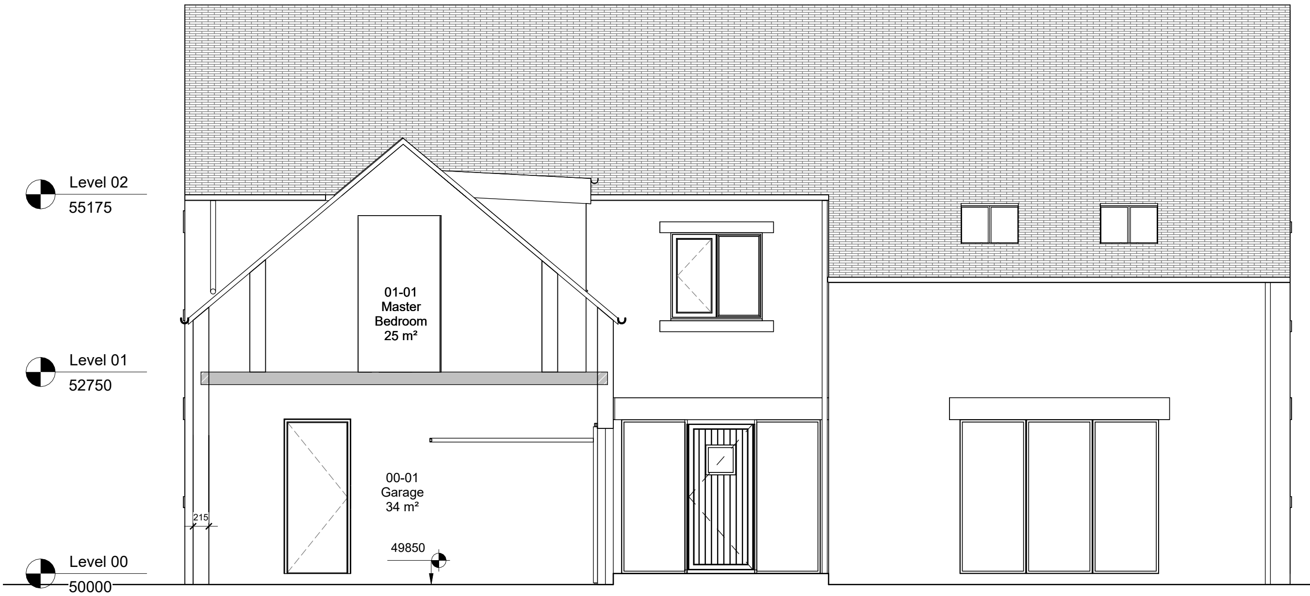
1 Existing - Section AA 1 : 50

Drawing Number WHA-PWA-VV-XX-DR-A-(GS)-0250