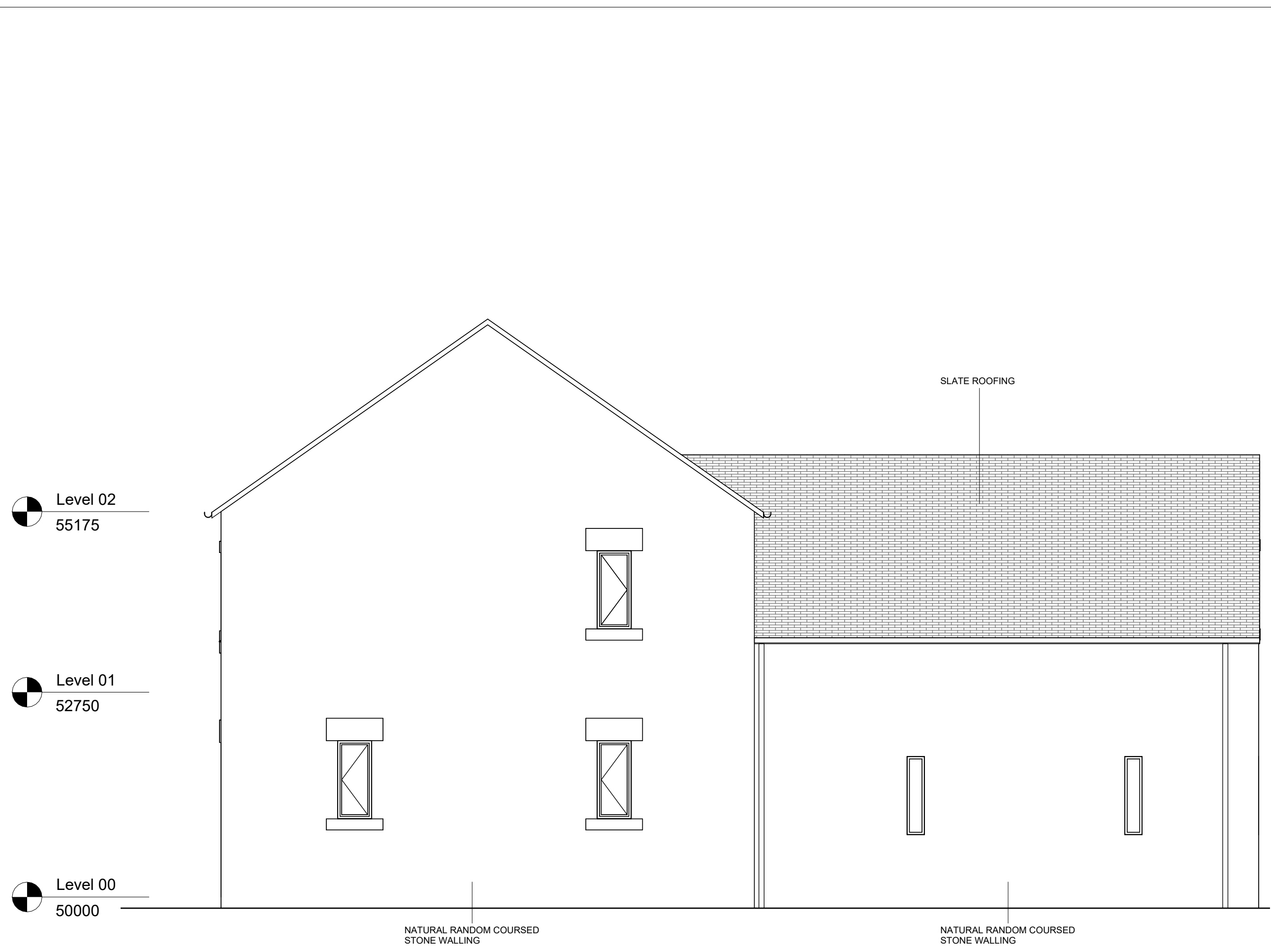
3 Proposed - Side Elevation A 1 : 50