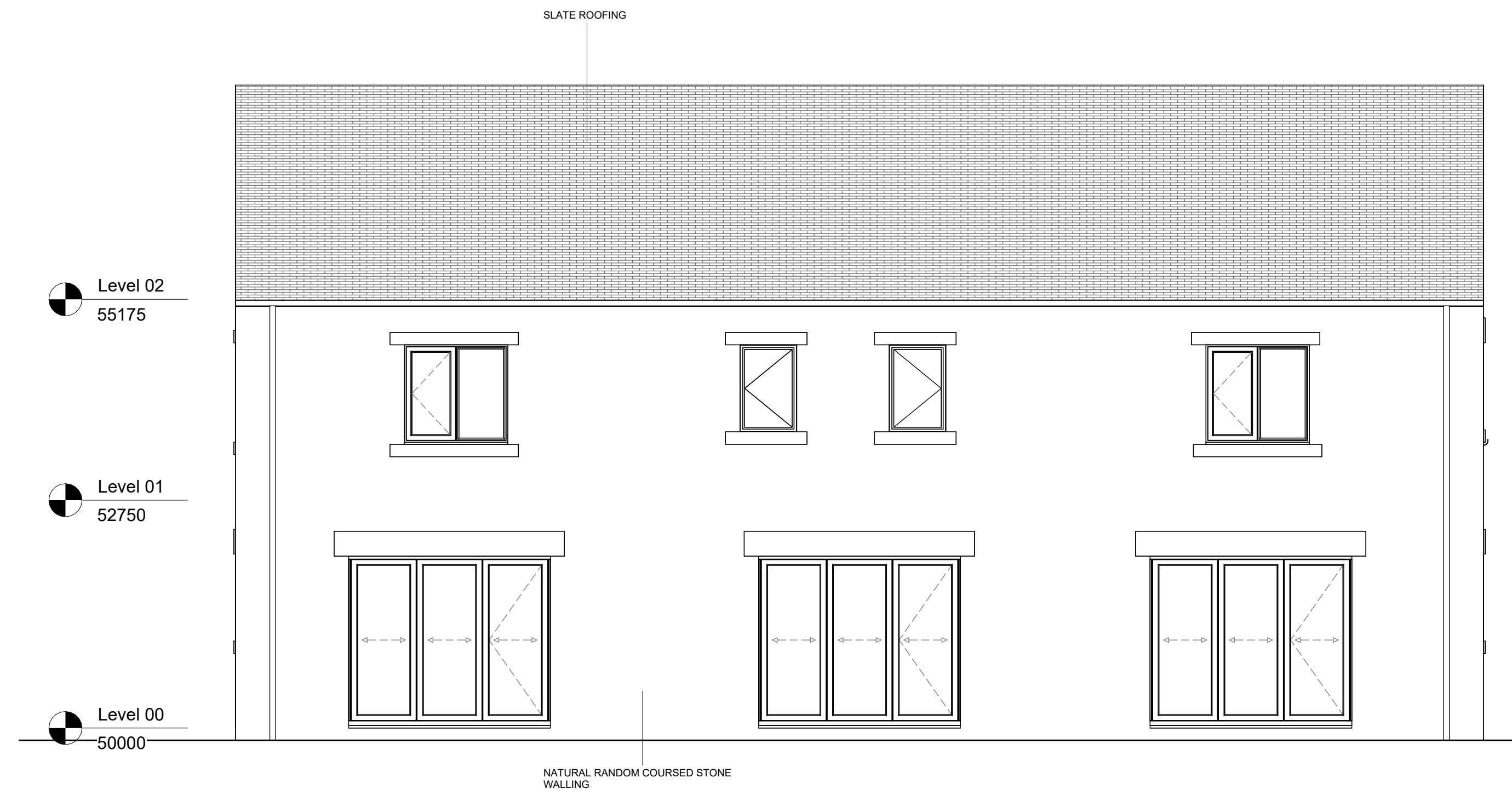
2 Proposed - Rear Elevation 1 : 50