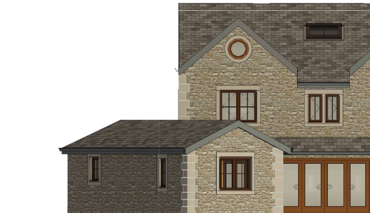
4 PROPOSED SOUTH EAST 1 : 50