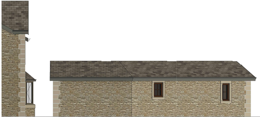
5 PROPOSED SOUTH WEST 1 : 50