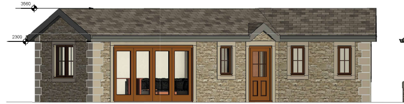
2 PROPOSED NORTH EAST 1 : 50