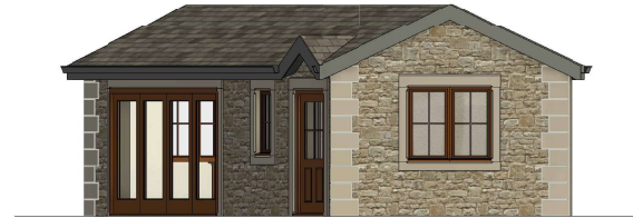
3 PROPOSED NORTH WEST 1 : 50