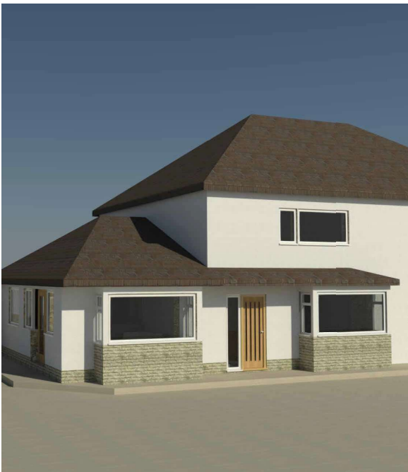
2 Visual 1 1 : 1