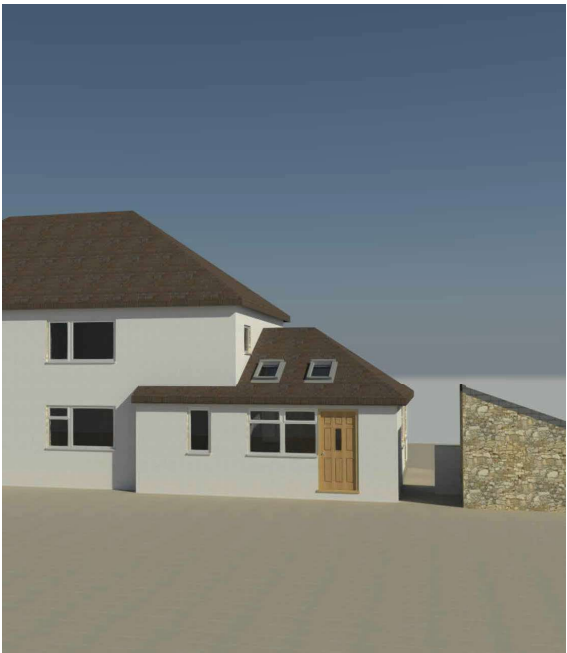
3 Visual 2 1 : 1