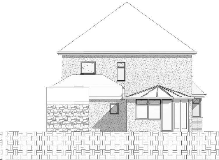
3 EXISTING WEST 1 : 50