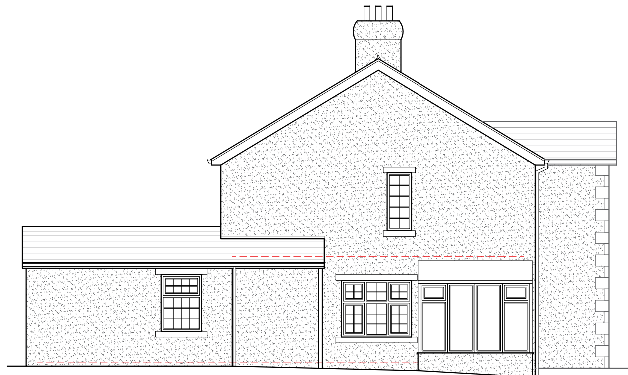
Existing South West Facing Elevation Scale 1:100