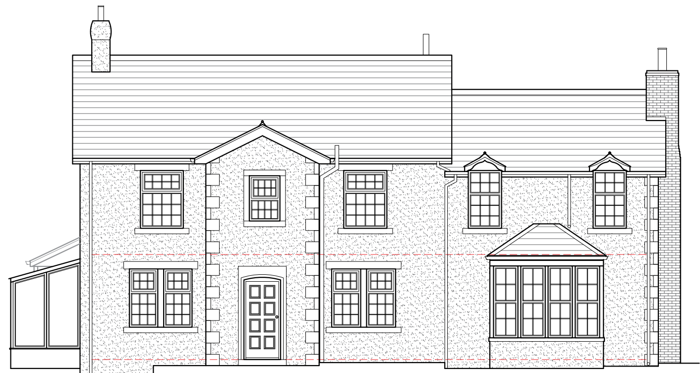
Existing South East Facing Elevation Scale 1:100