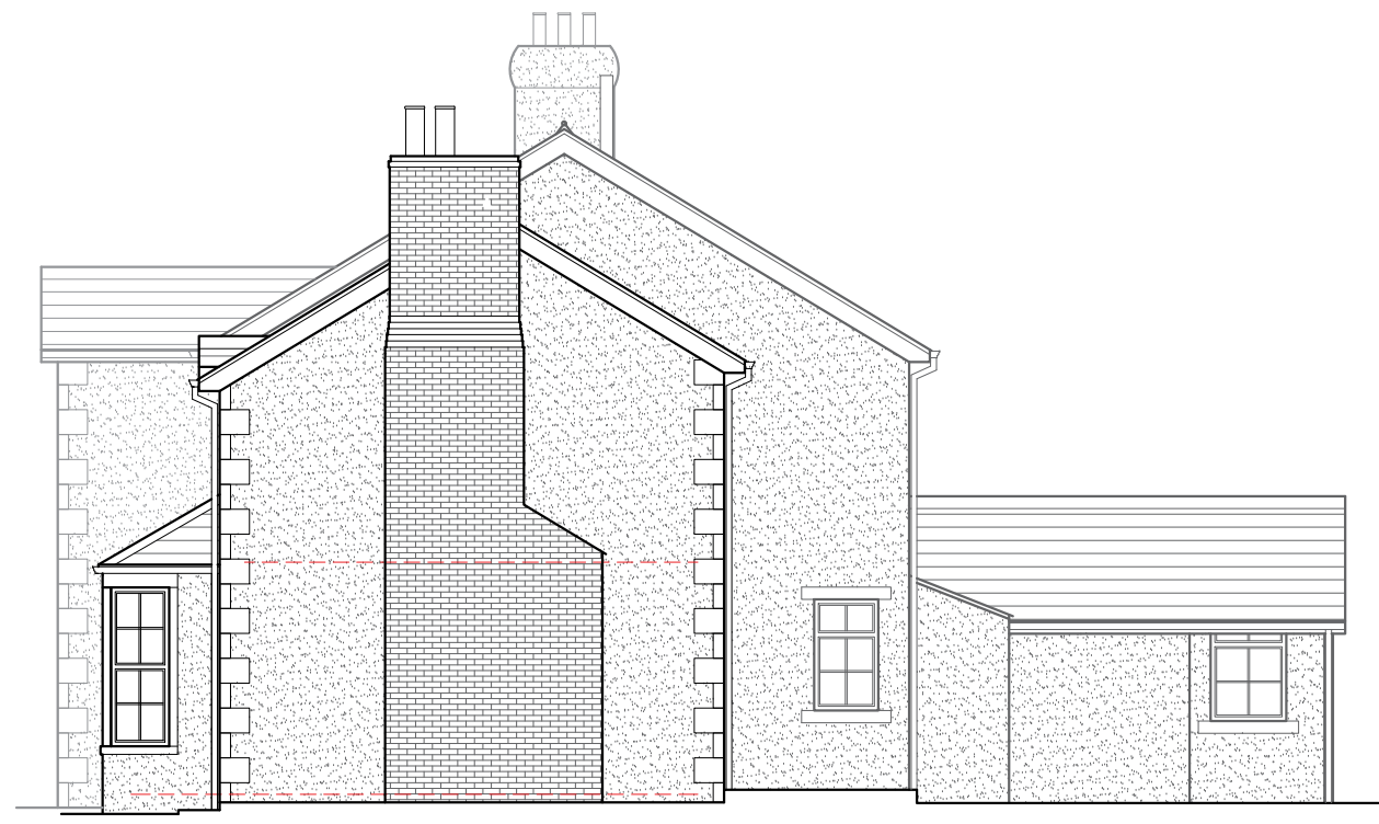
Existing North East Facing Elevation Scale 1:100