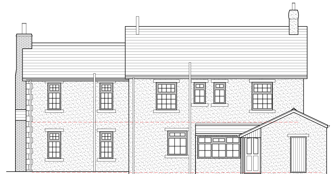
Existing North West Facing Elevation Scale 1:100