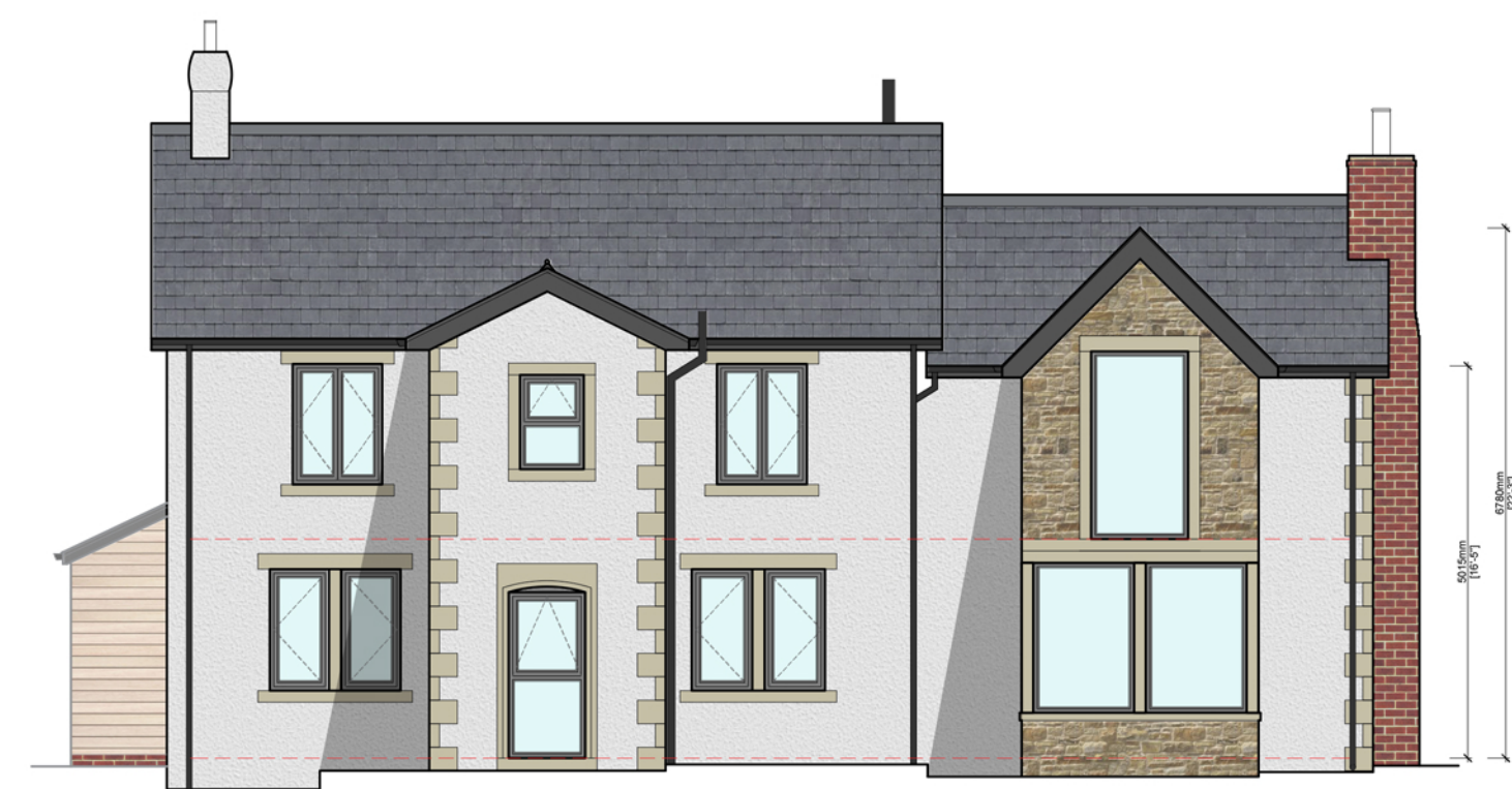
Proposed South East Facing Elevation Scale 1:100