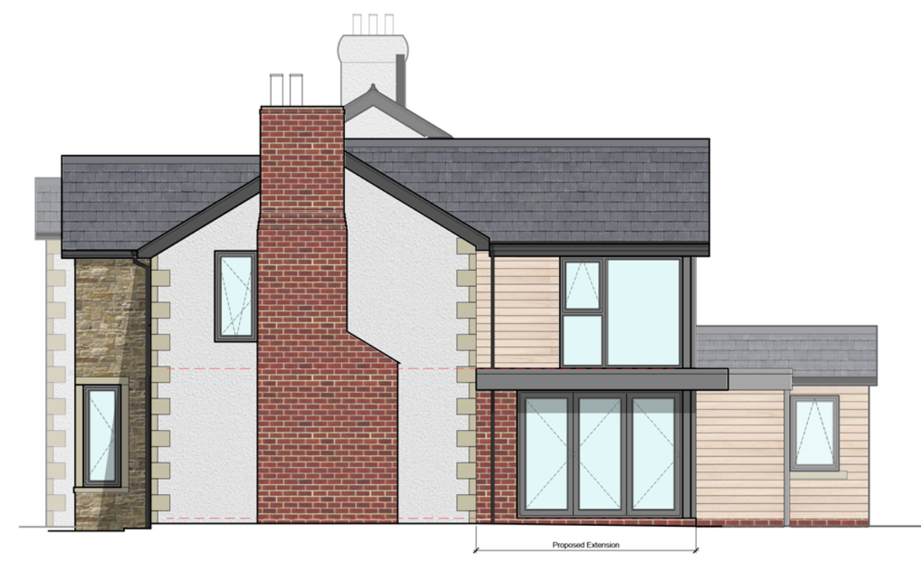
Proposed North East Facing Elevation Scale 1:100