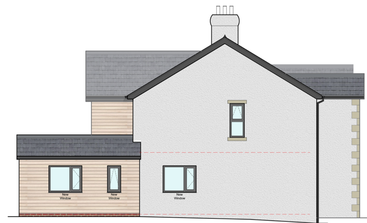
Proposed South West Facing Elevation Scale 1:100