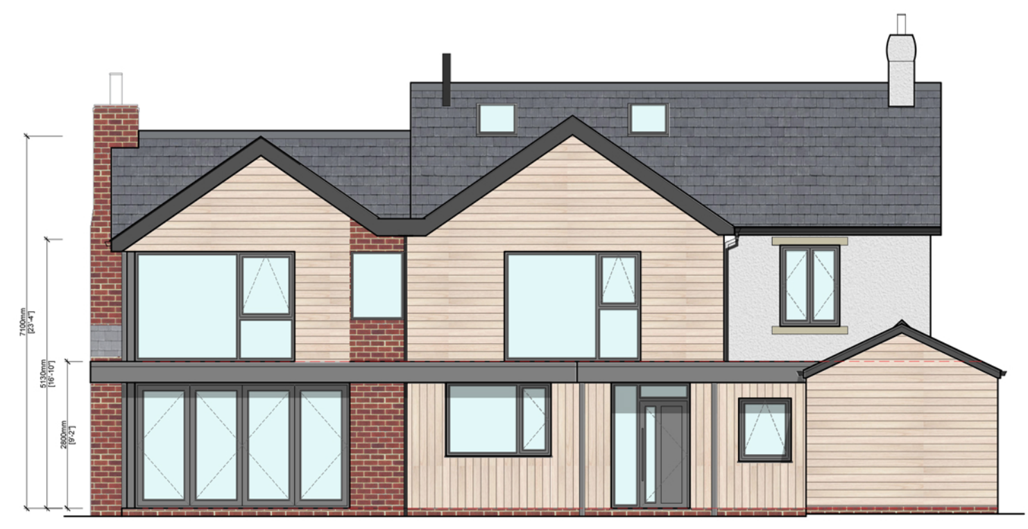
Proposed North West Facing Elevation Scale 1:100