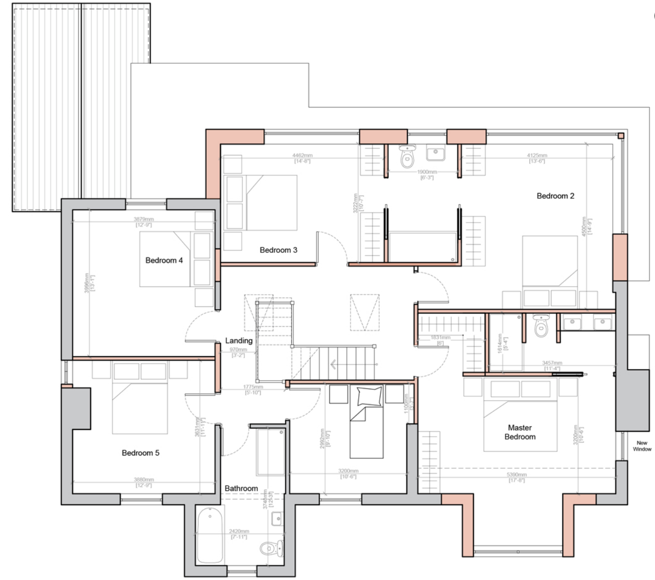
Proposed First Floor Plan Scale 1:100