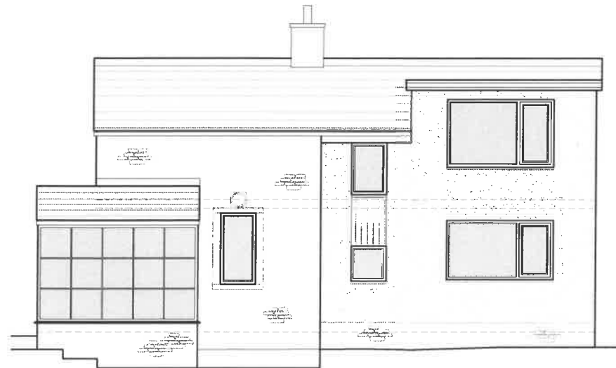
Existing South East Facing Elevation Scale 1:100

This drawing is to be read in conjunction with all relevant Architect, consultants' and specialists' drawings and specifications. The Architect is to be notified of any discrepancies before proceeding. Do not scale from this drawing. All dimensions and levels are to be checked on site. This drawing is subject to copyright. All work carried out before Planning and Building Permission has been granted is at the contractor/clients risk. Note: proposed drawing based on OS dwg information. All illustrated dimensions are approximate and all site dimensions are to be checked on site and subject to site survey.