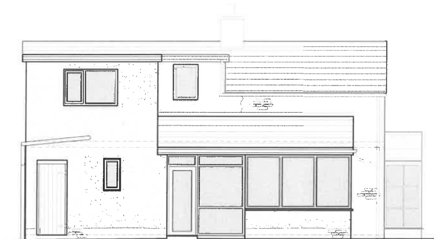
Existing North West Facing Elevation Scale 1:100