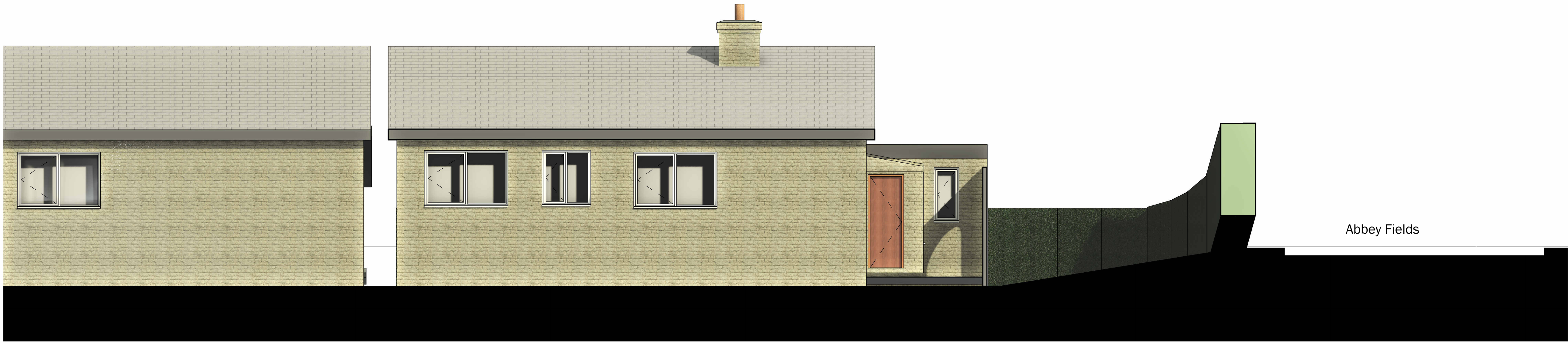
1 EXISTING NORTH 1 : 50