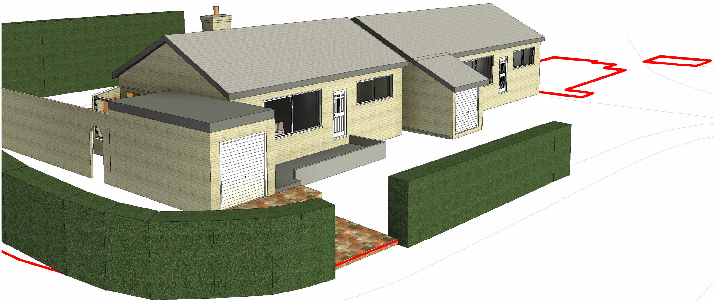
1 Exterior 1 Existing