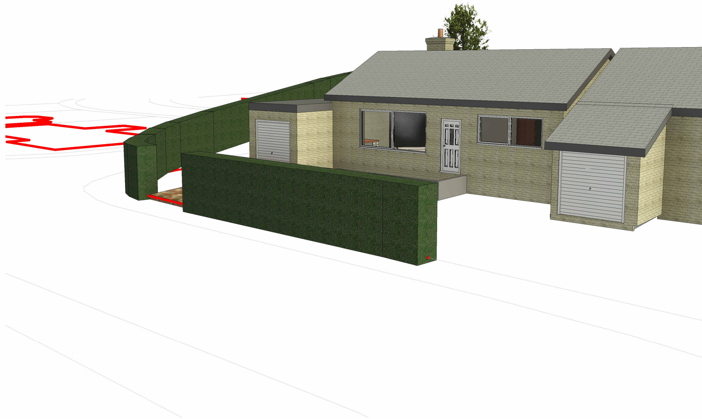
3 Exterior 2 Existing