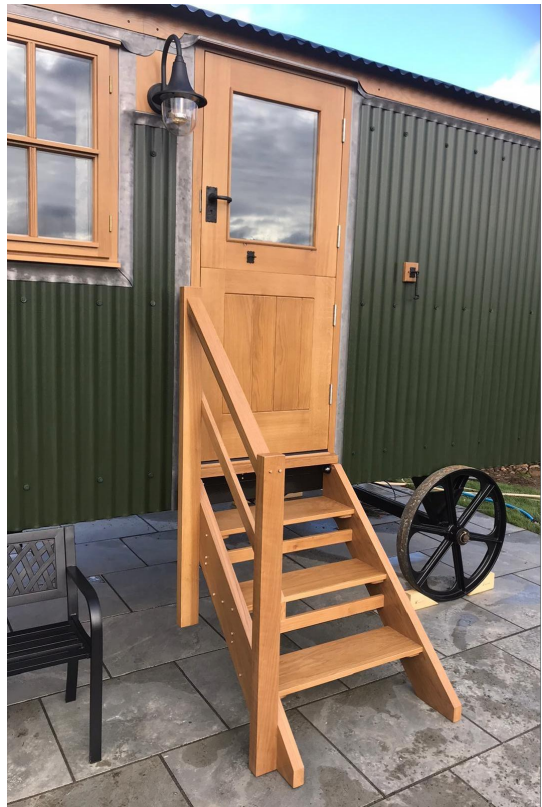
EXAMPLE OF EXTERNAL LIGHTING