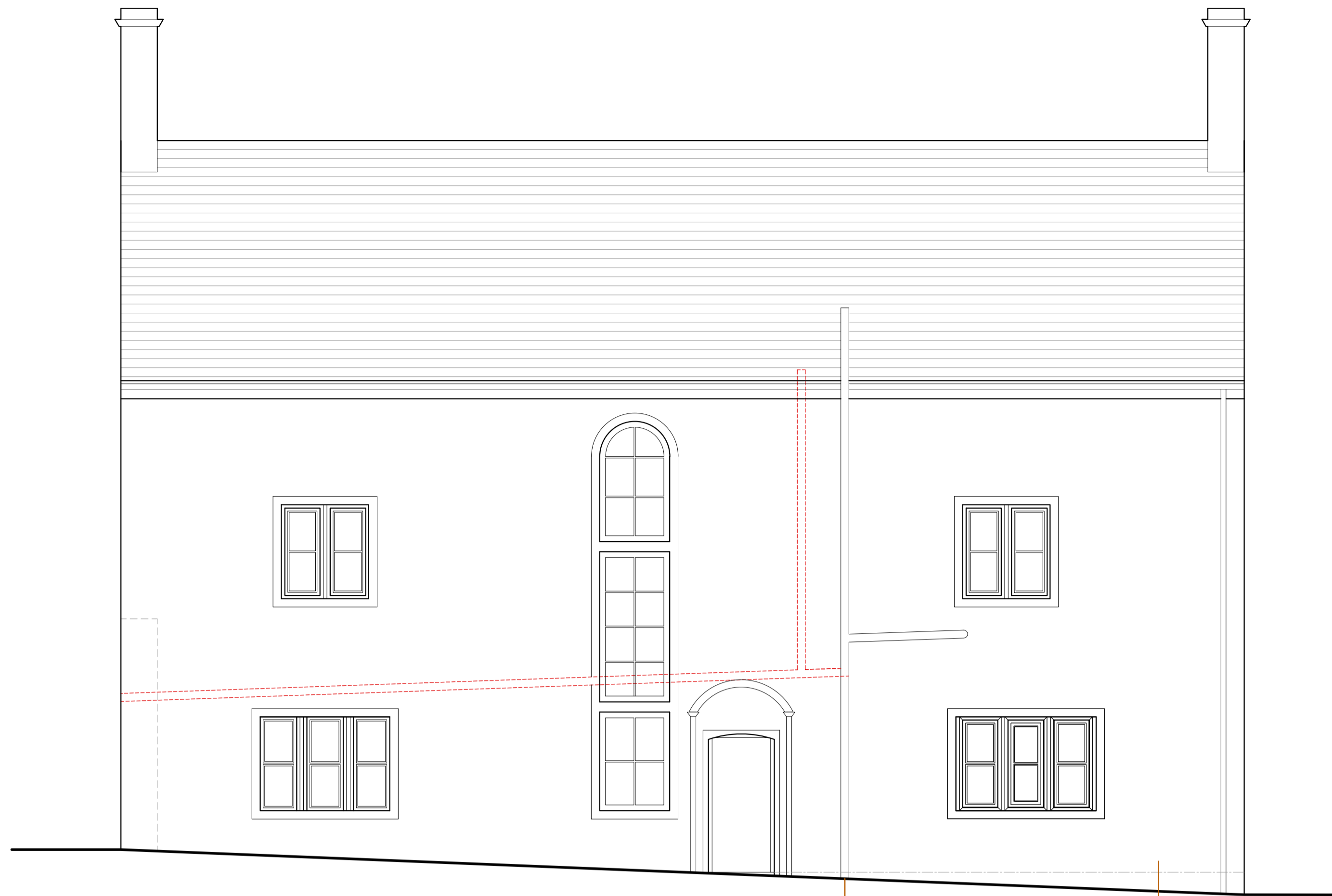
PROPOSED REAR (NORTH WEST) ELEVATION Scale 1:50