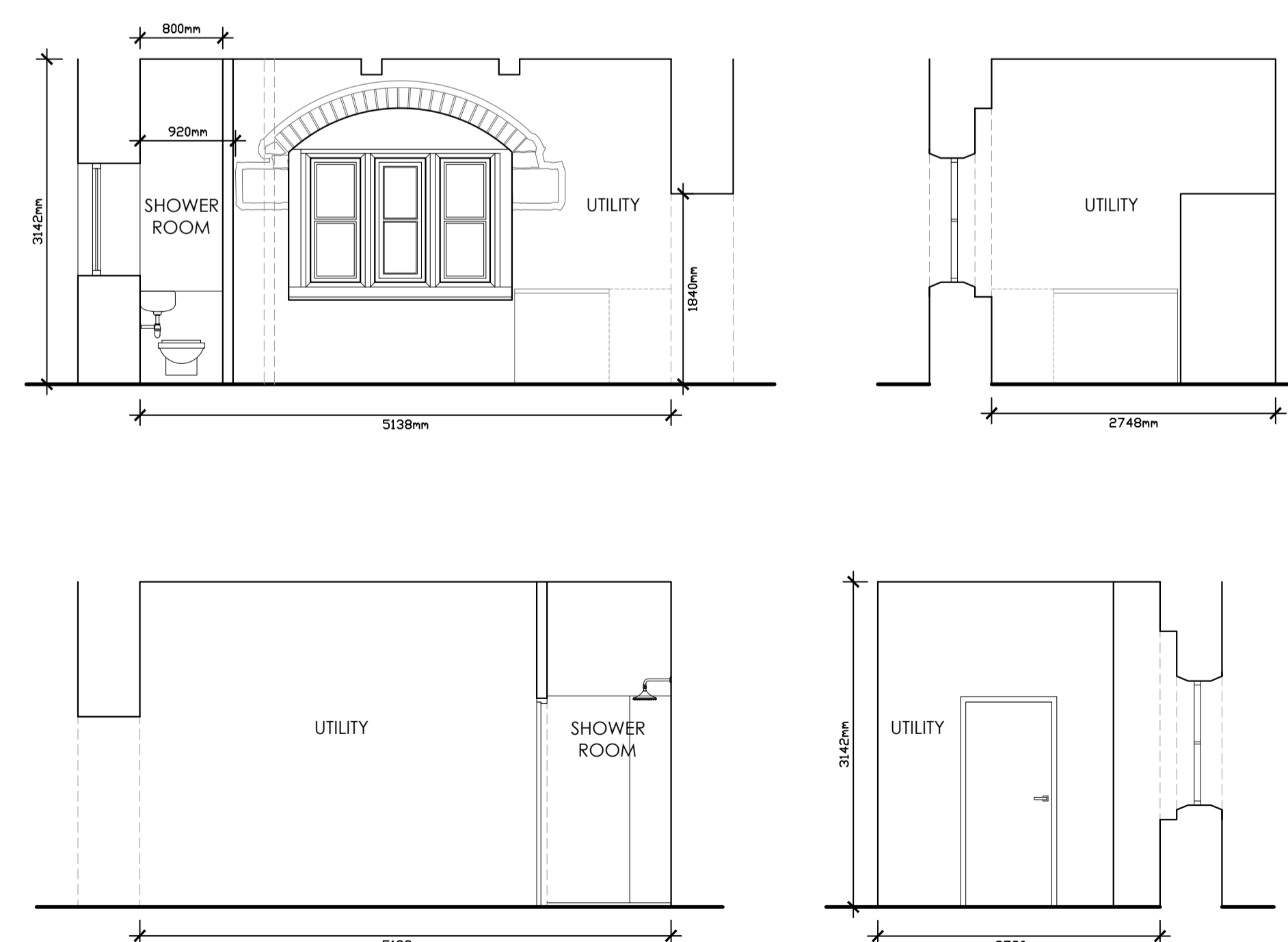
PROPOSED UTILITY ROOM INTERNAL ELEVATIONS Scale 1:50

REV A TDM Shower room label added. 15.11.23