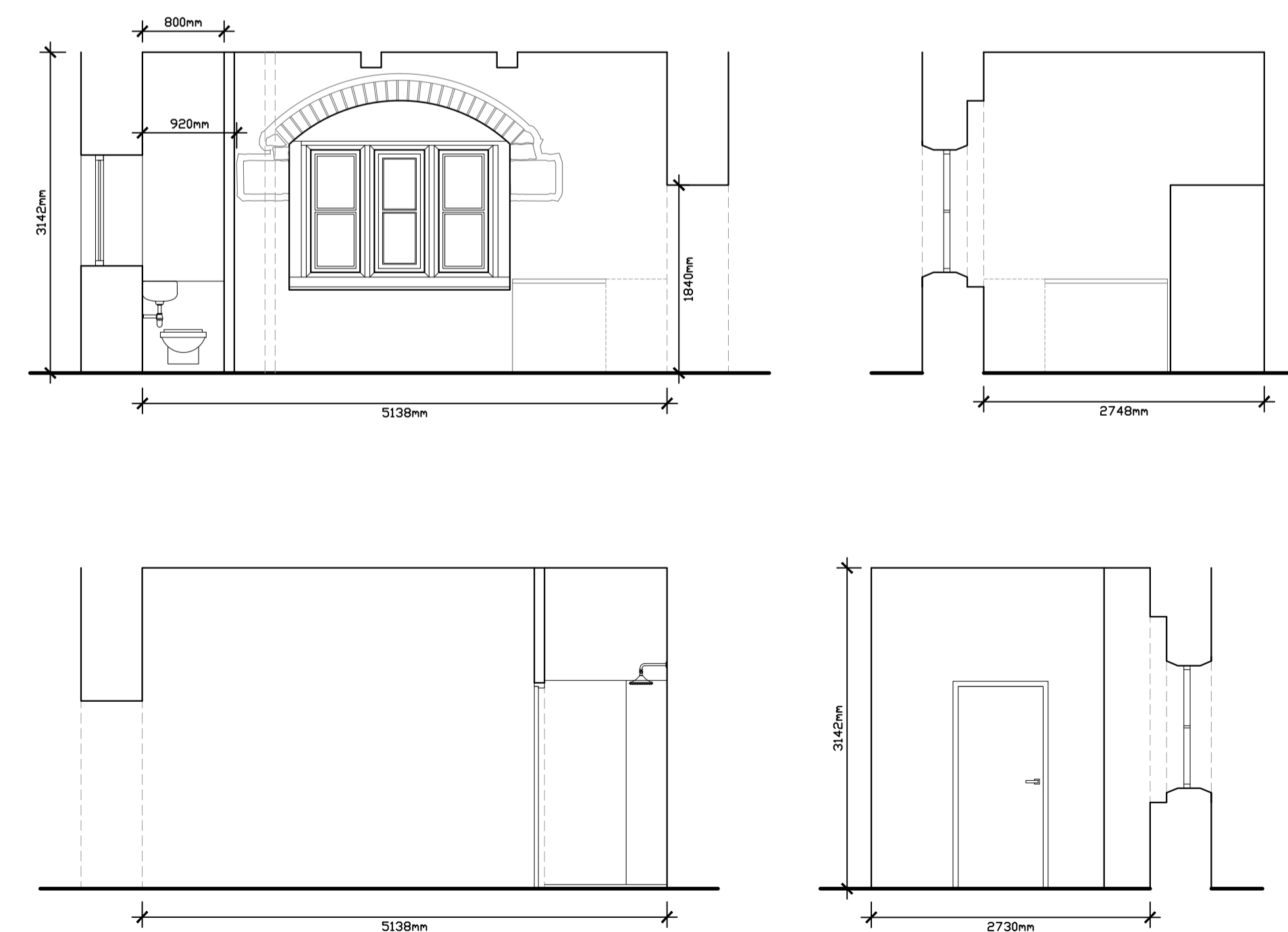
PROPOSED UTILITY ROOM INTERNAL ELEVATIONS Scale 1:50