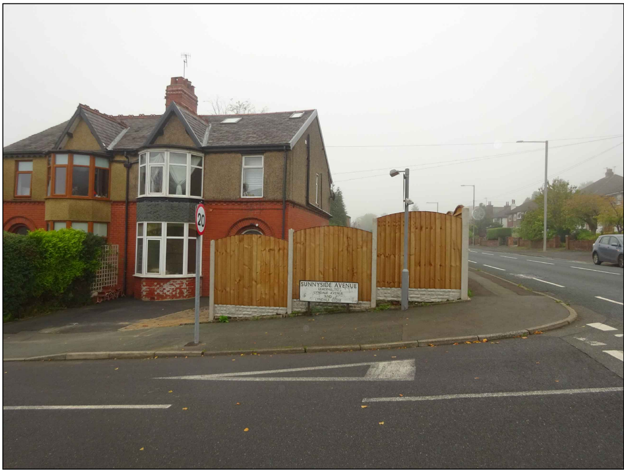
Front Elevation A-A: New boundary treatment