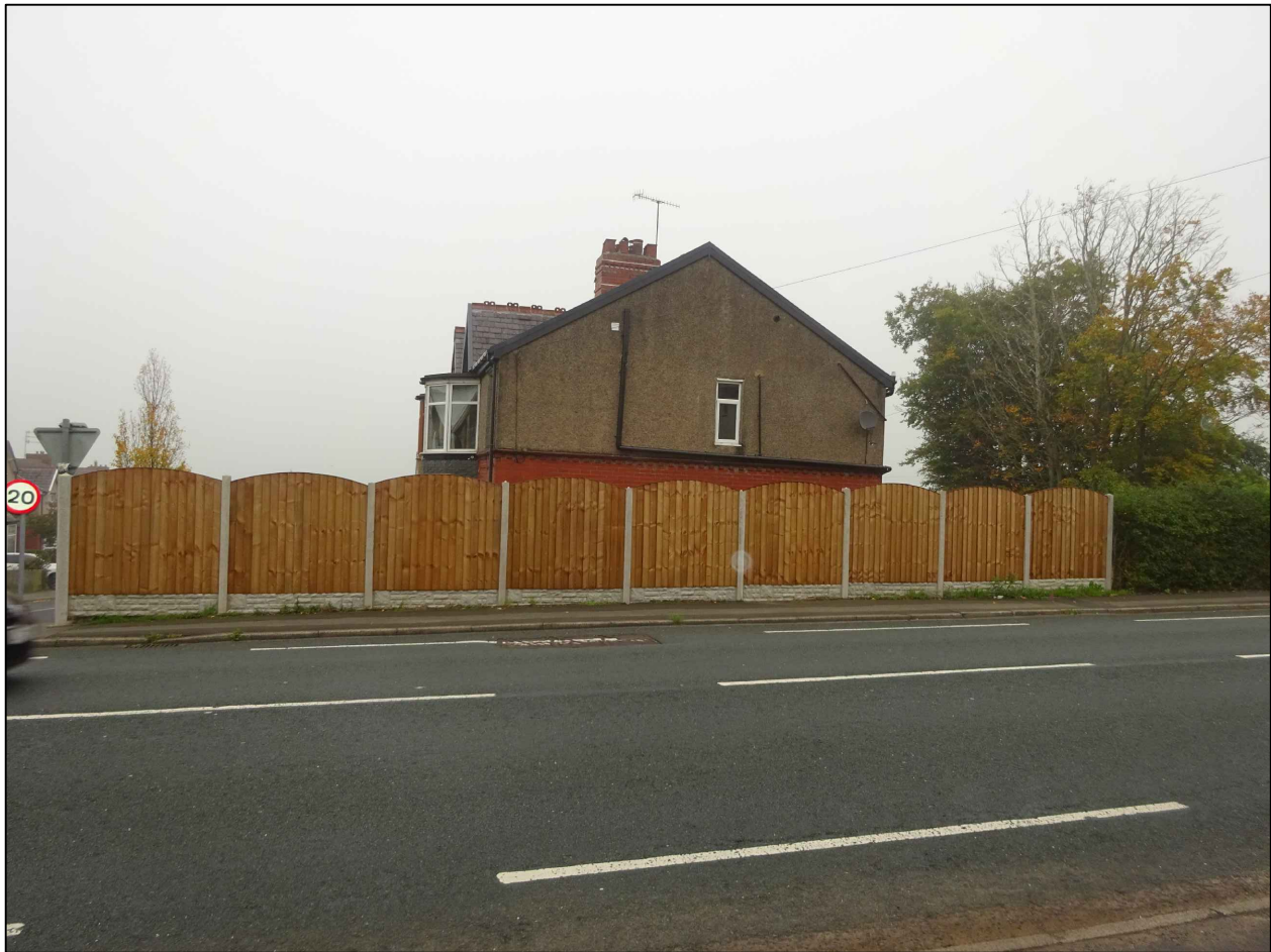
Side Elevation B-B: New boundary treatment

Concrete post 100mm by 135mm infilled with pressure treated timber close boarded arch fence panels 1600mm high by 1800mm wide, sat on 300mm concrete base boards with rock face finish (9nr bays) along Whalley Road.