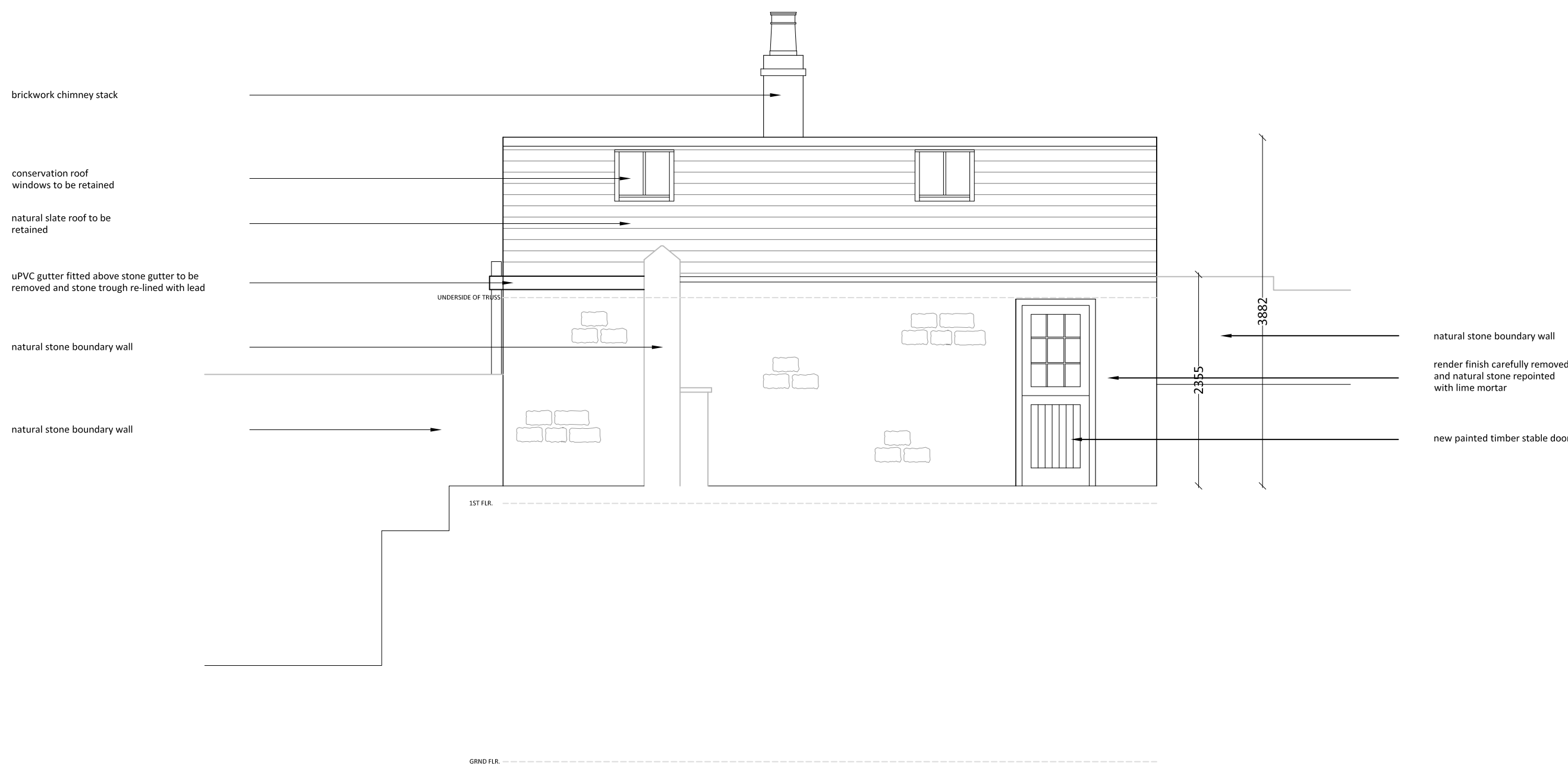
PROPOSED REAR ELEVATION 1:50 @ A1