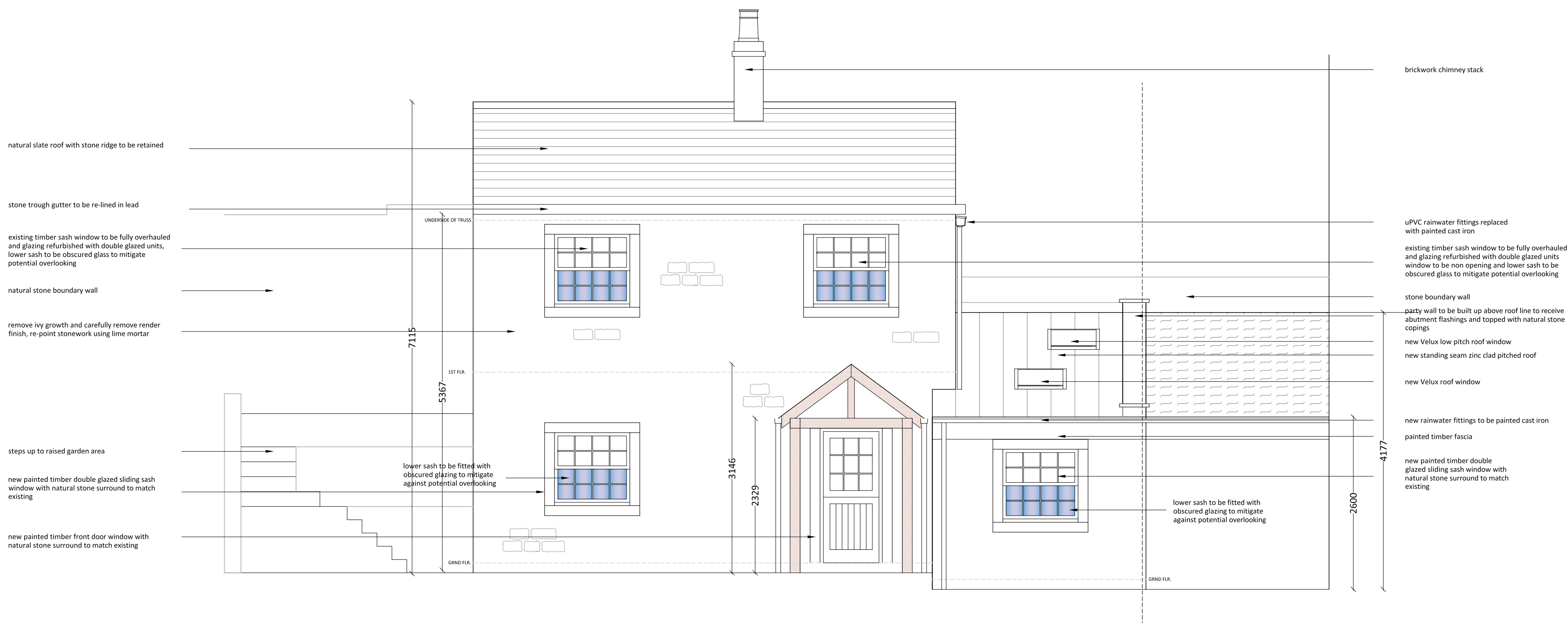
PROPOSED FRONT ELEVATION 1:50 @ A1