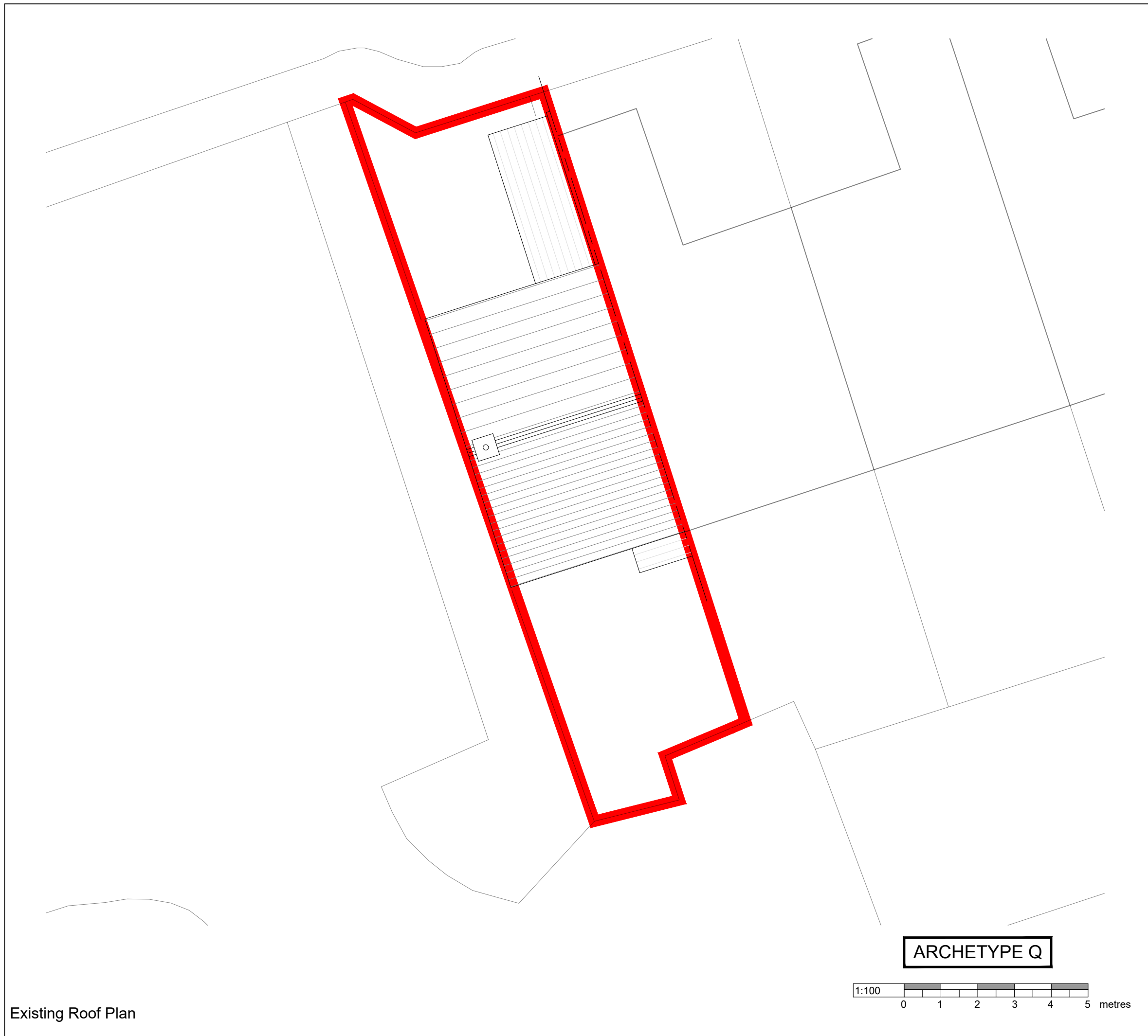
Existing Roof Plan