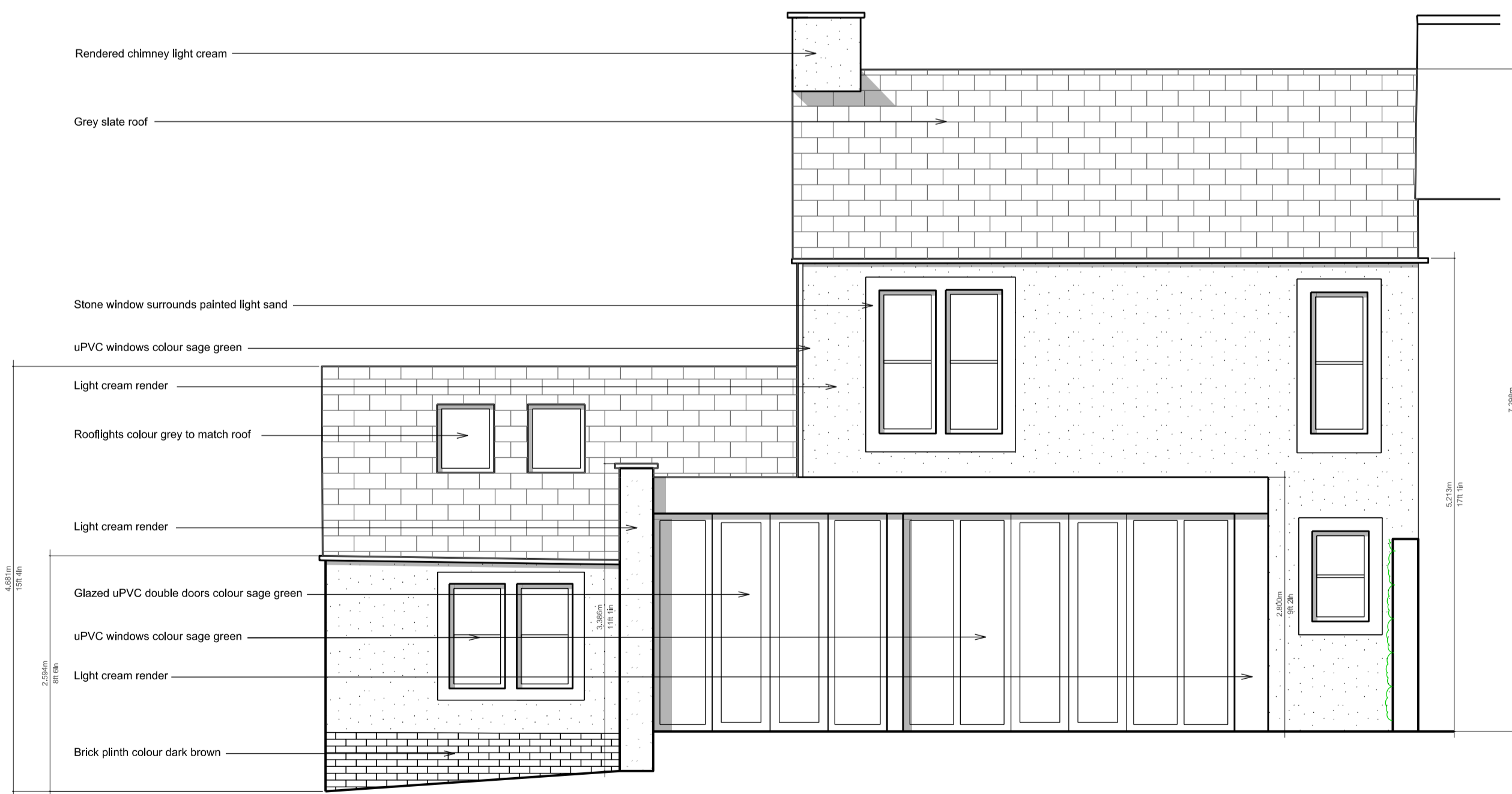
Proposed Rear Elevation Scale 1:50

Notes This drawing, together with the design it illustrates, is copyright and may not be reproduced in any form, without the written consent of Zara Moon Architects. Do not scale off this drawing except for determination of basic layout - only figured dimensions to be used. All dimensions to be checked on site.