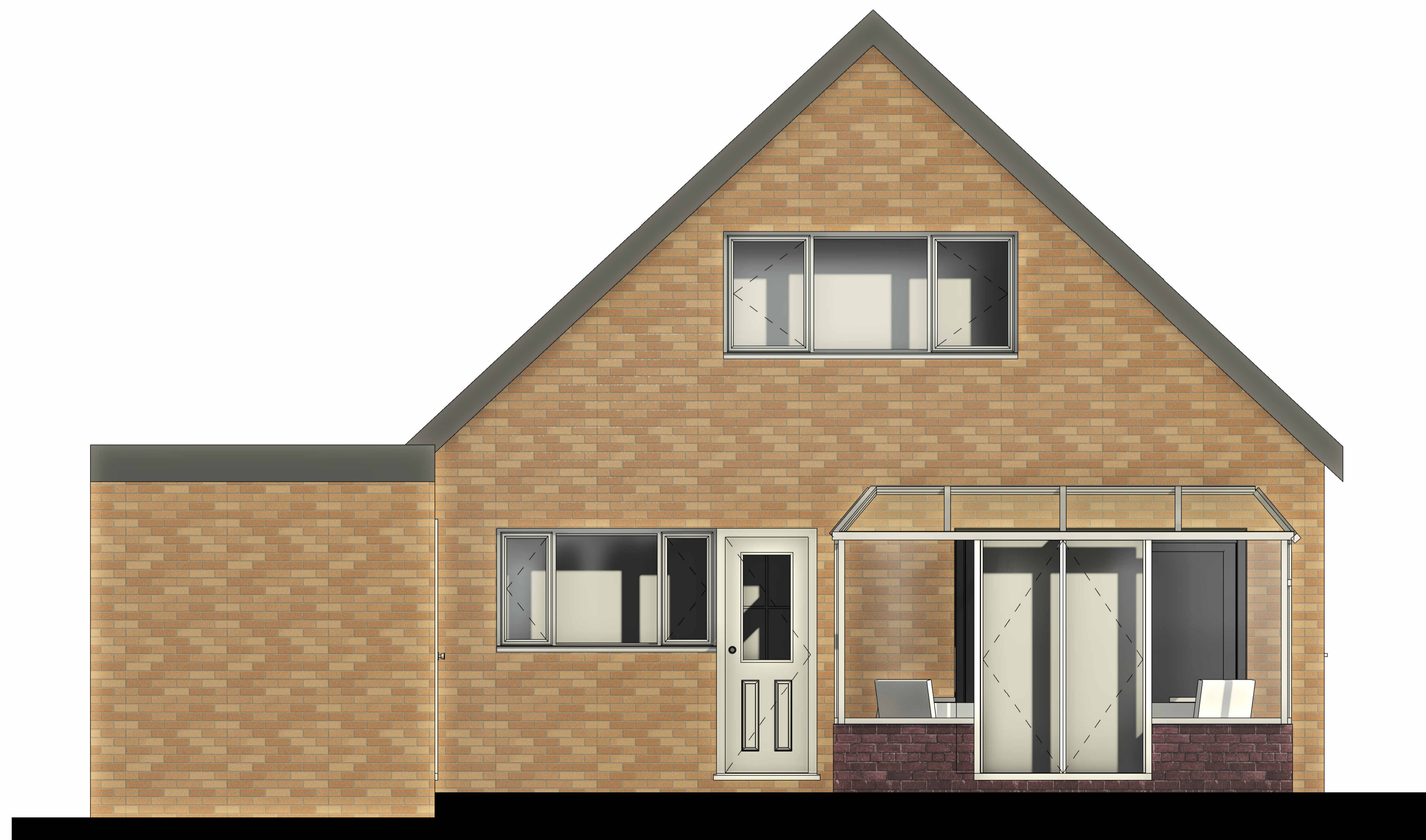
2 EXISTING WEST 1 : 25