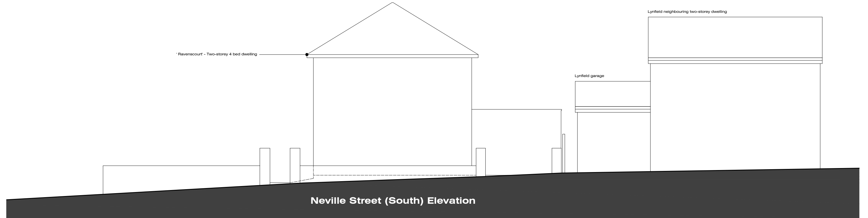
Neville Street (South) Elevation

NEW DWELLINGS - RAVENSCOURT - NEVILLE STREET - LONGRIDGE - PRESTON - PR3 3FD