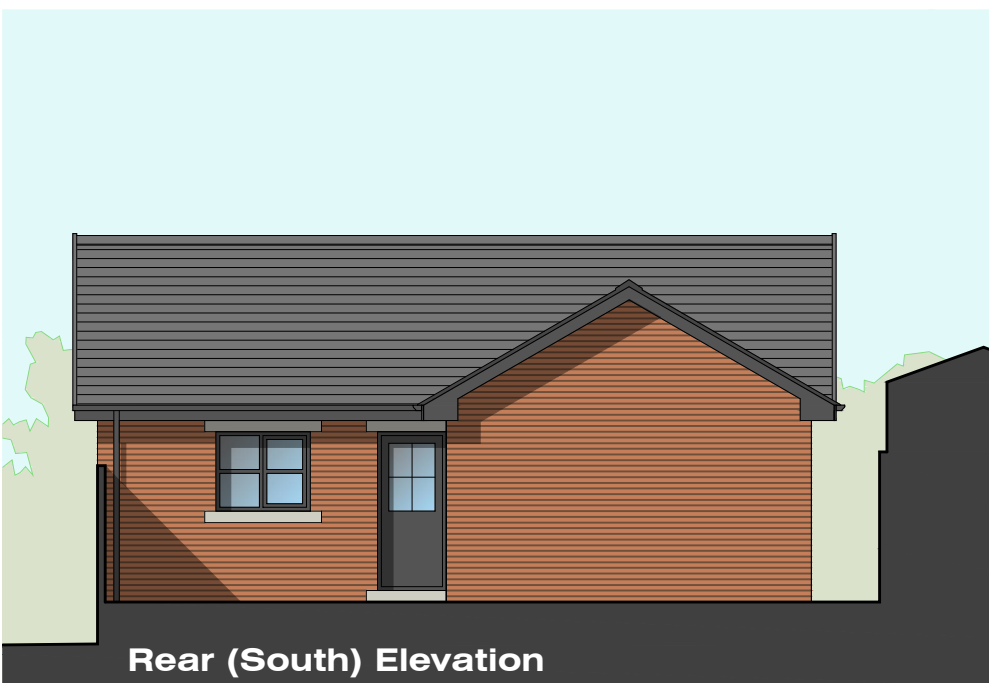
Rear (South) Elevation