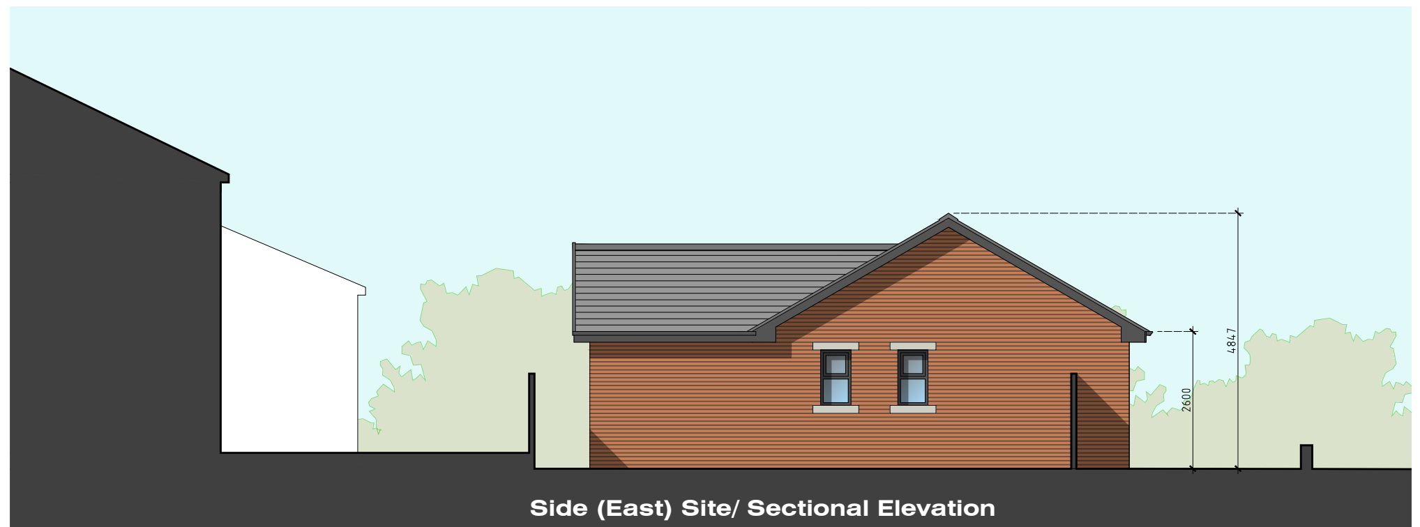
Side (East) Site/ Sectional Elevation