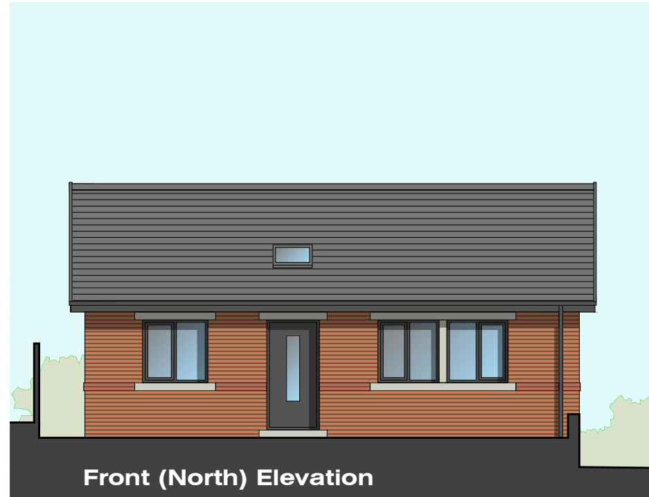
Front (North) Elevation