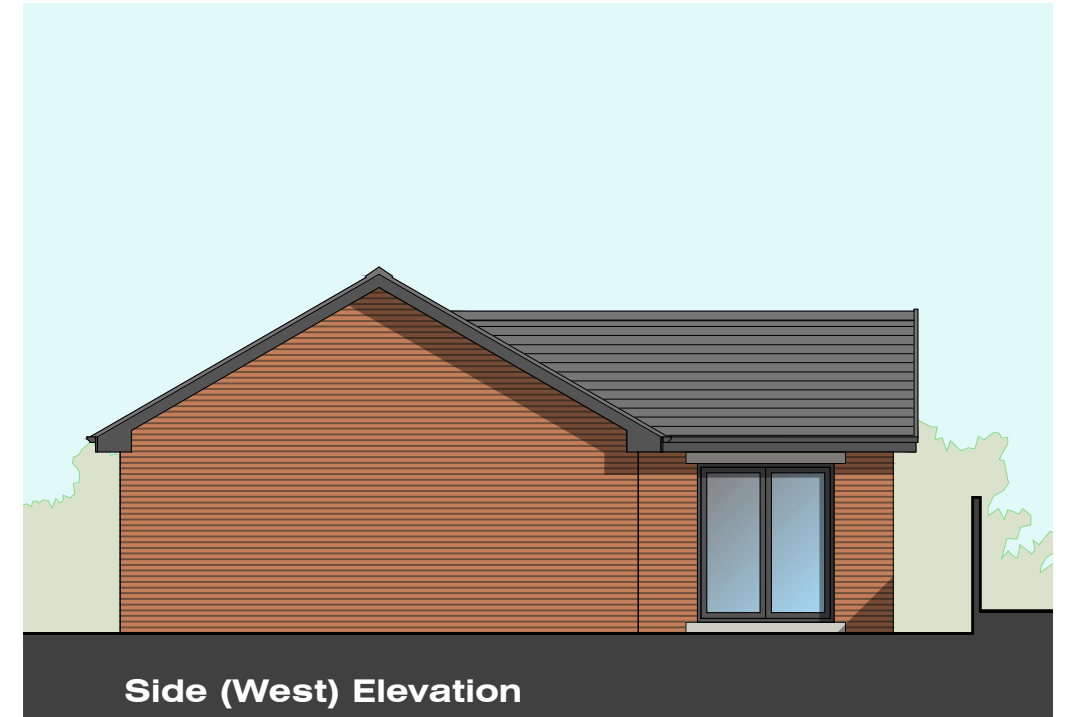
Side (West) Elevation