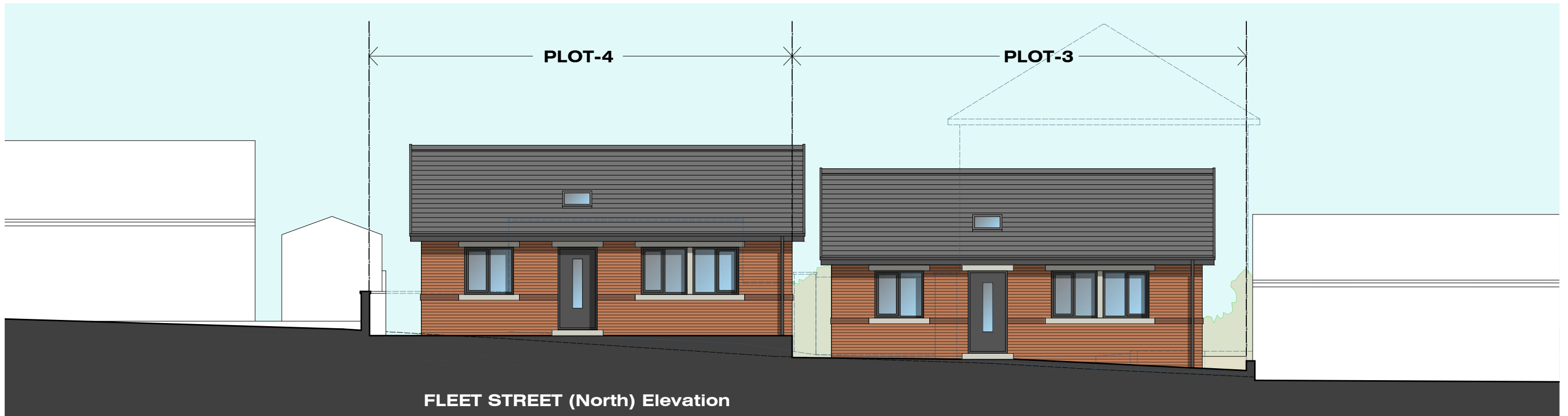
FLEET STREET (North) Elevation