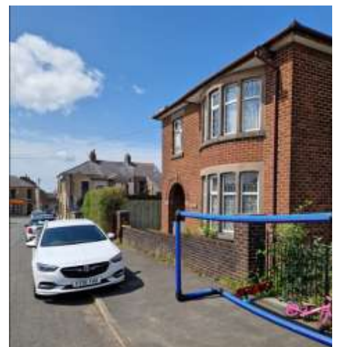
Views from Neville Street