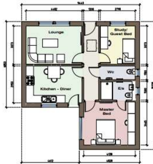
GROUND FLOOR PLAN PLOTS 3 & 4 (67.5M 2 ) Scale 1:100