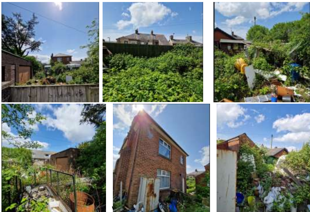
Views within Site showing overgrown derelict state of the property.