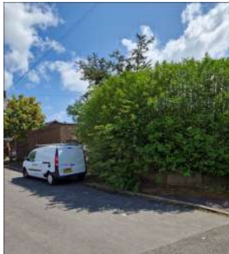
Views from Fleet Street