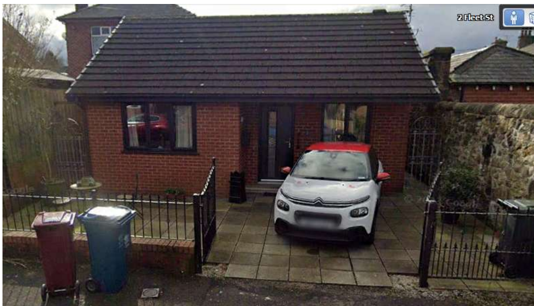
2 Fleet Street – small bungalow