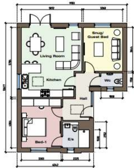
GROUND FLOOR PLAN PLOTS 1 & 2 handed (69.8M 2 ) Scale 1:100