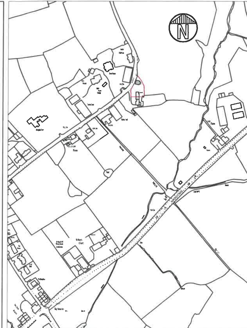
SITE LOCATION PLAN SCALE 1:5000