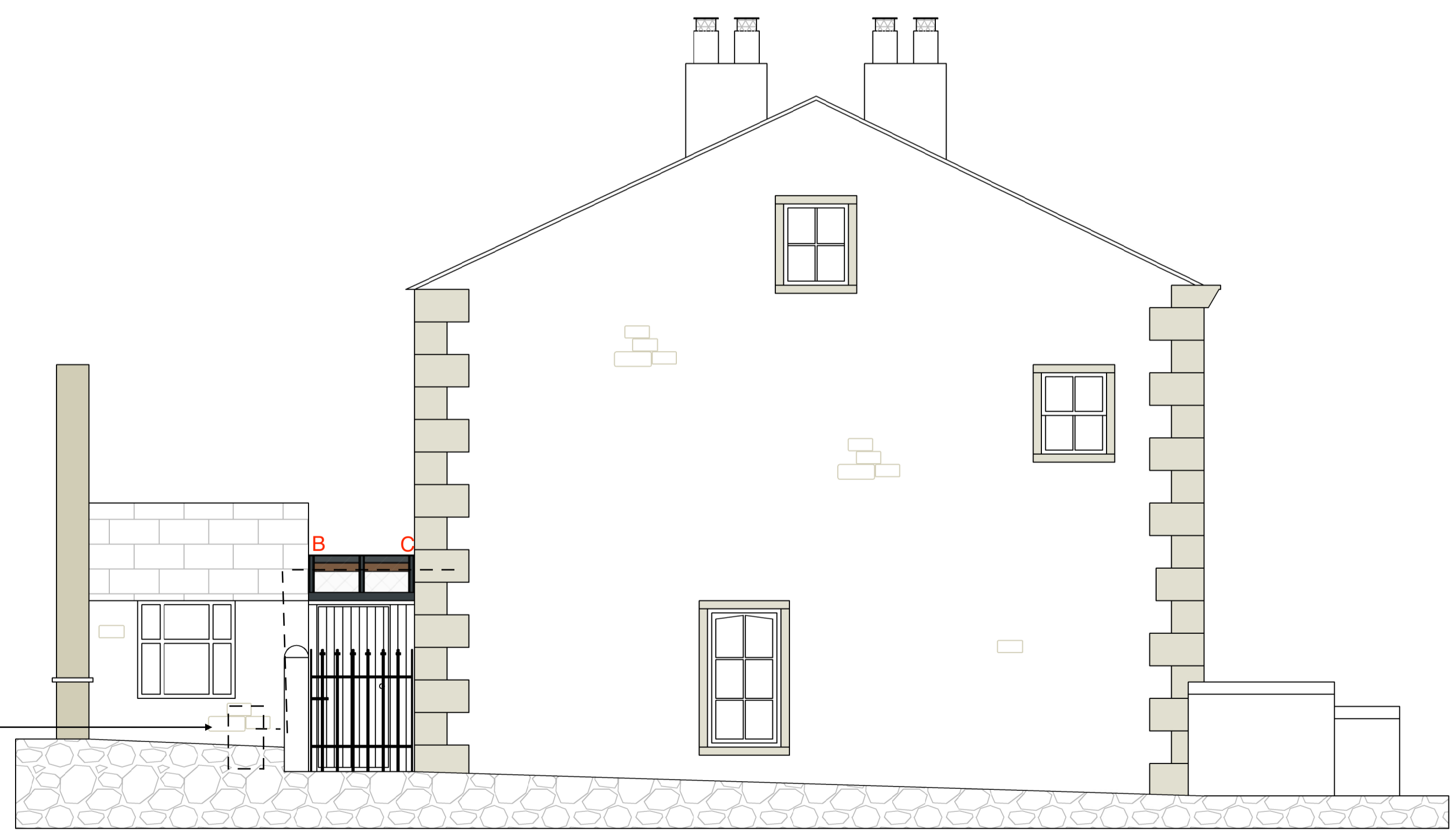
Proposed West Elevation (Front view from Malt Kiln Lane)