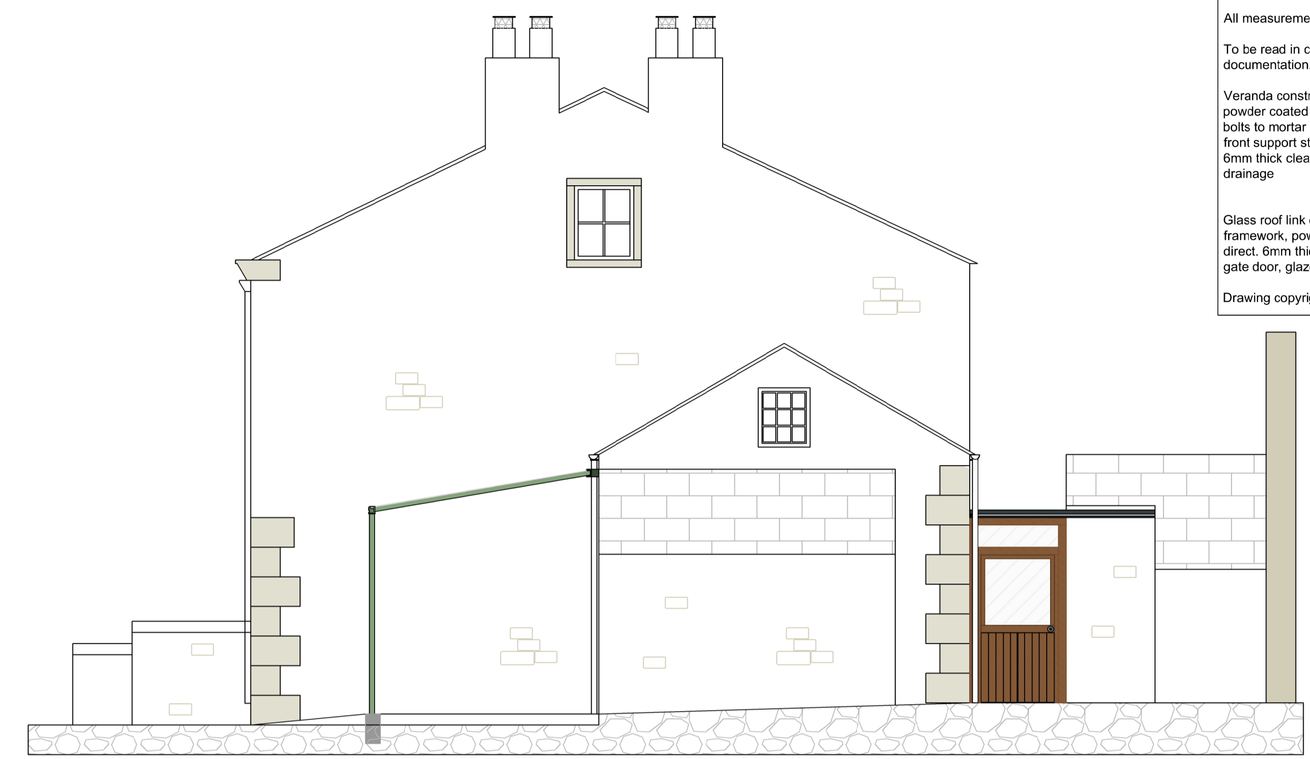
Proposed East Elevation (Rear view from Malt Kiln Lane)