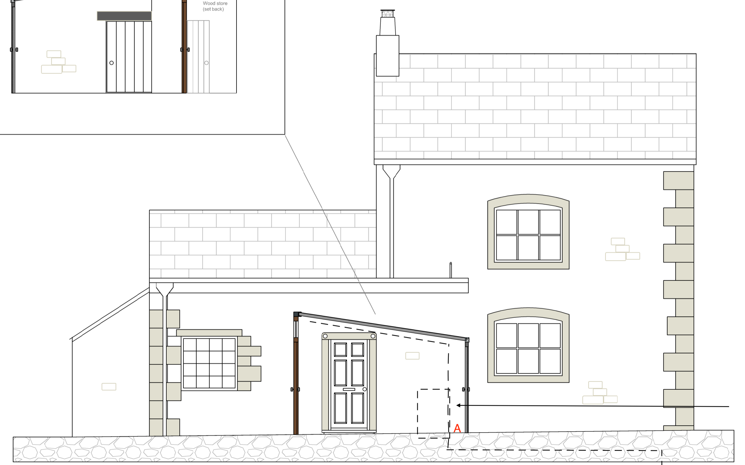
Proposed South Elevation (Side view from Malt Kiln Lane)