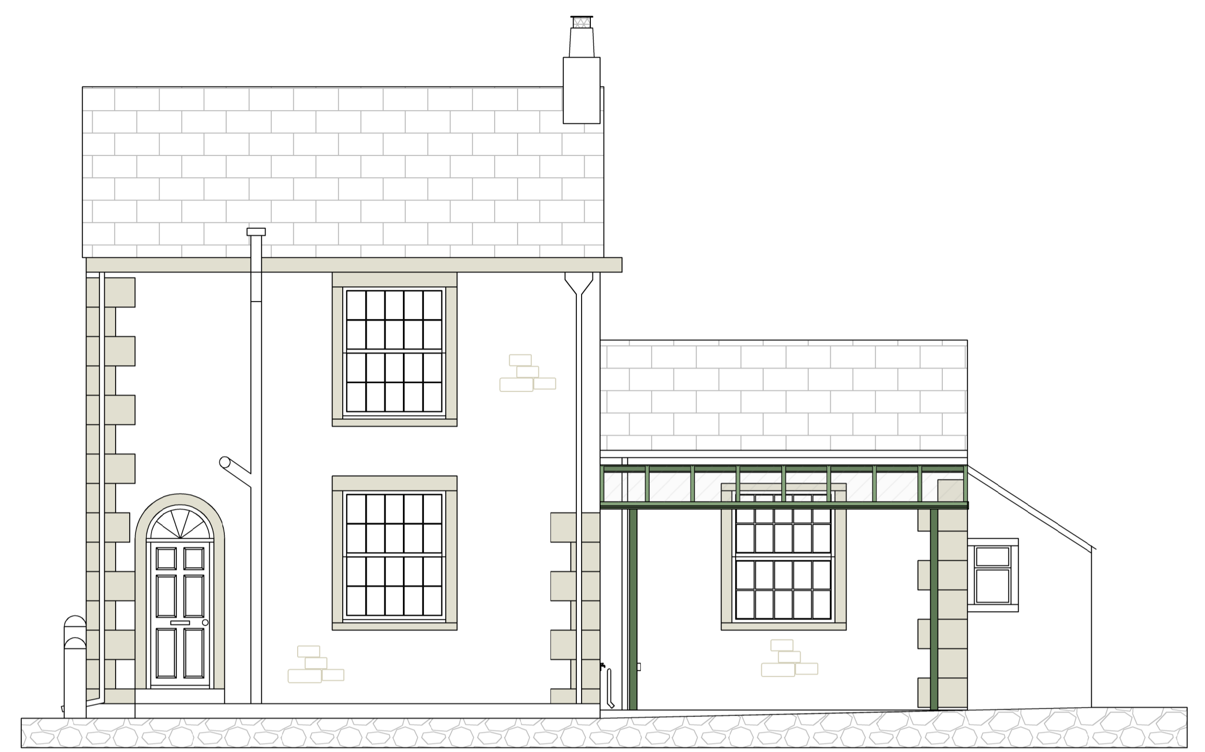
Proposed North Elevation (Side view from Malt Kiln Lane)