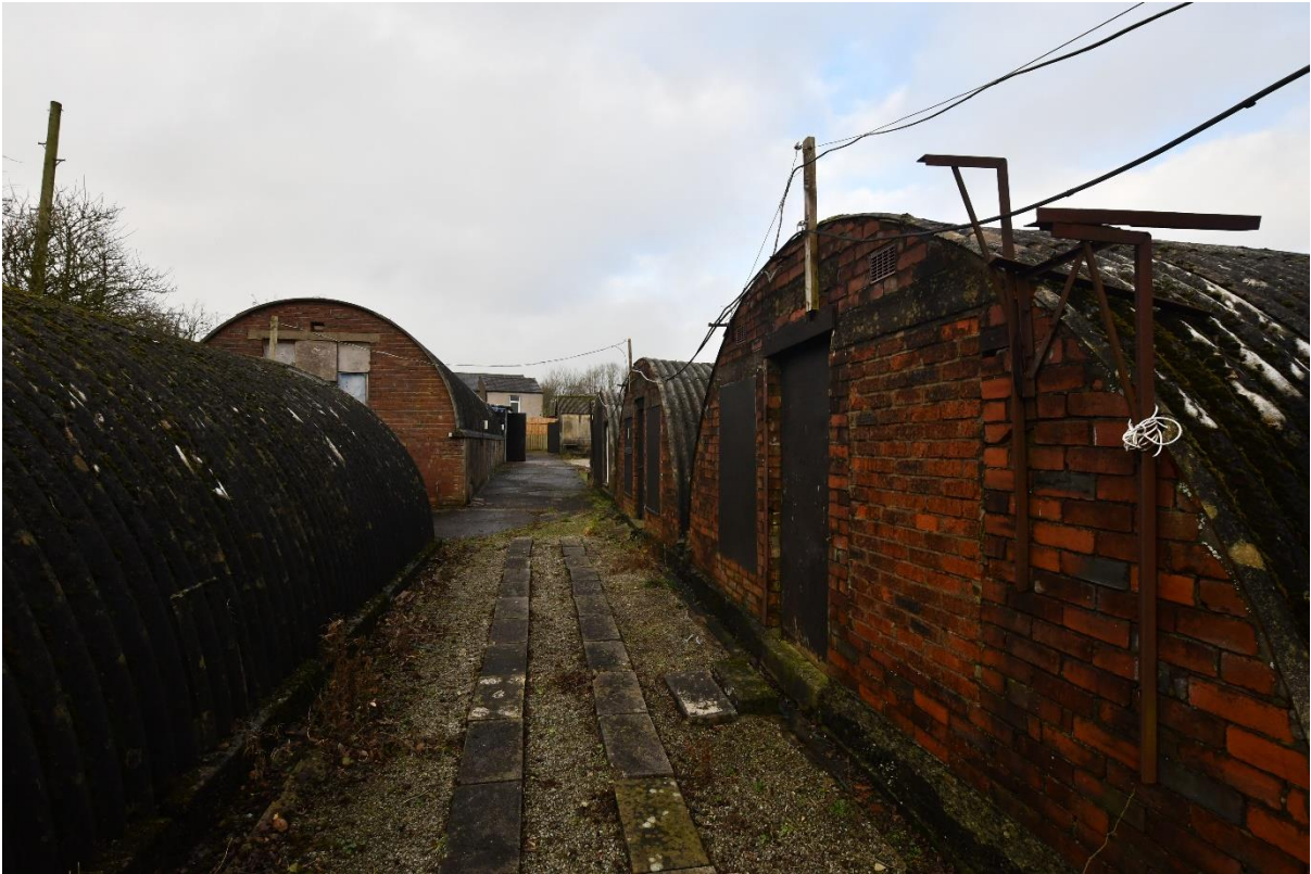
Image 5 Looking north through the various buildings