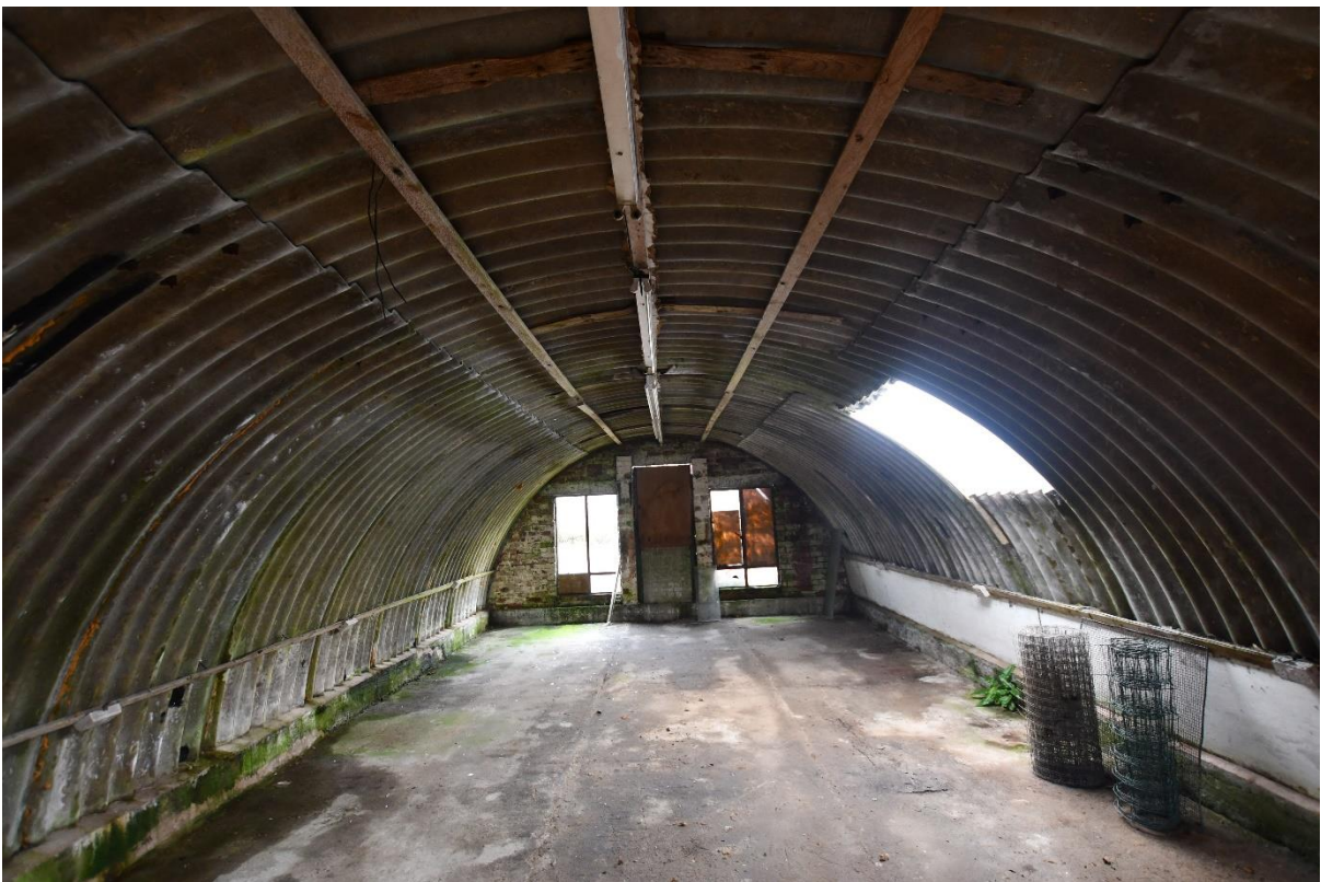
Image 6 Internal structure with ambient light