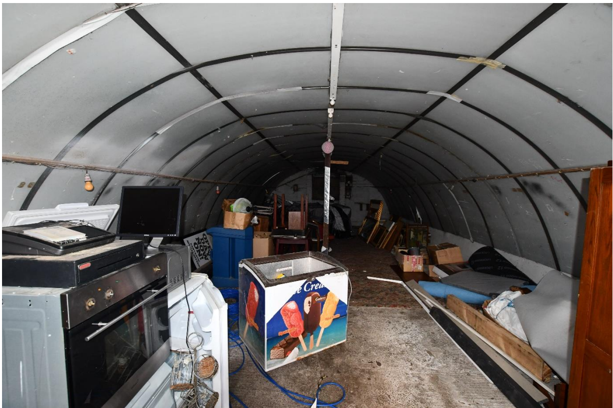
Image 4 Internal structure of large workshop target building