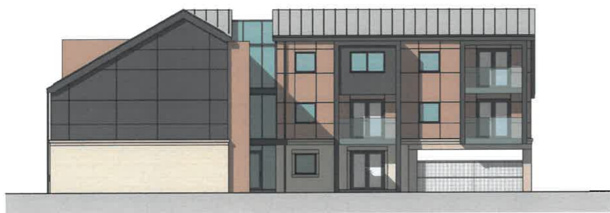
East Elevation 1:100