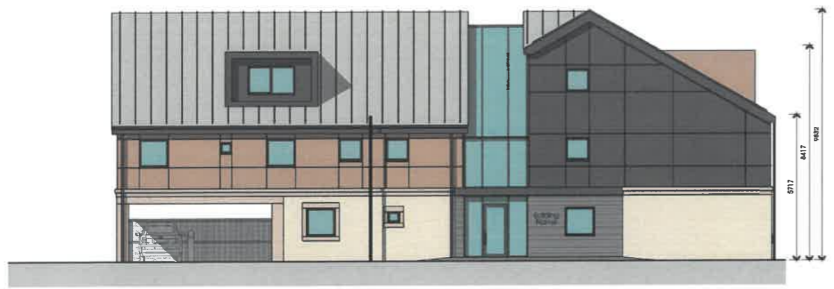
West Elevation 1:100 0 1 2 3 4 5m

NOTES: 1: Do not scale this drawing, use figured dimensions only 2: The Contractor, Sub Contractor or specialist supplier are responsible for confirming site dimensions prior to fabrication 3: Any dimensional discrepancies are to be reported to the Architect immediately