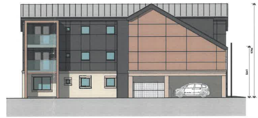
North Elevation 1:100