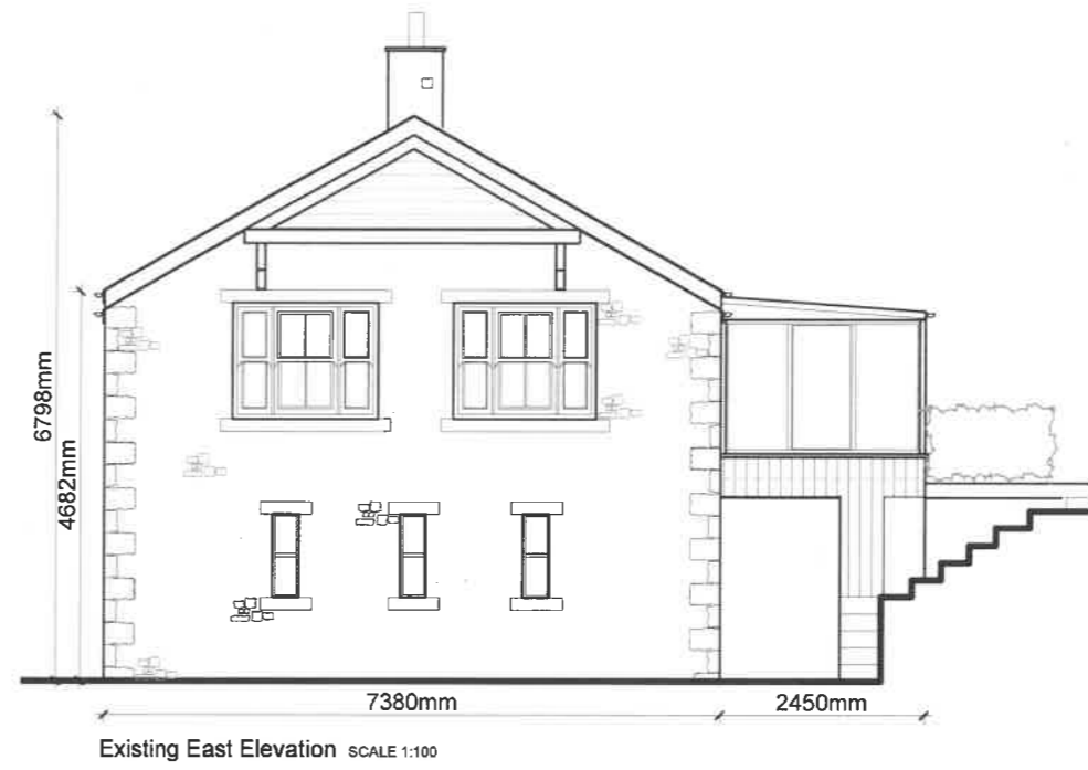
Existing East Elevation SCALE 1:100

Client Mr and Mrs Duddle Job Title Proposed Extension at: Meadowcroft Clough Lane Thornley