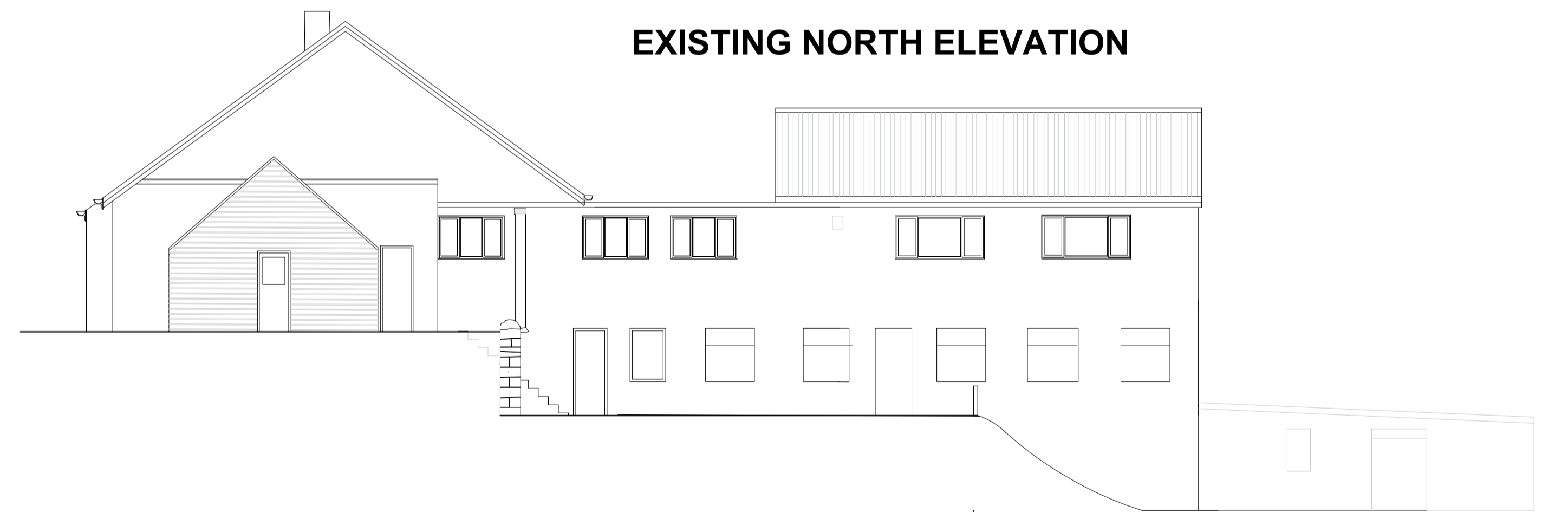
Existing building at lower level (Pendle Hill Ski slope)