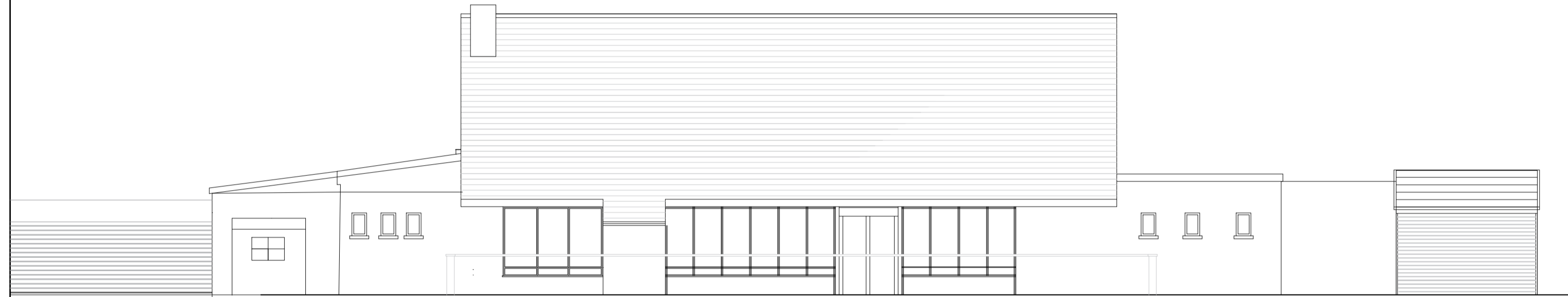
Existing front elevation of restaurant.